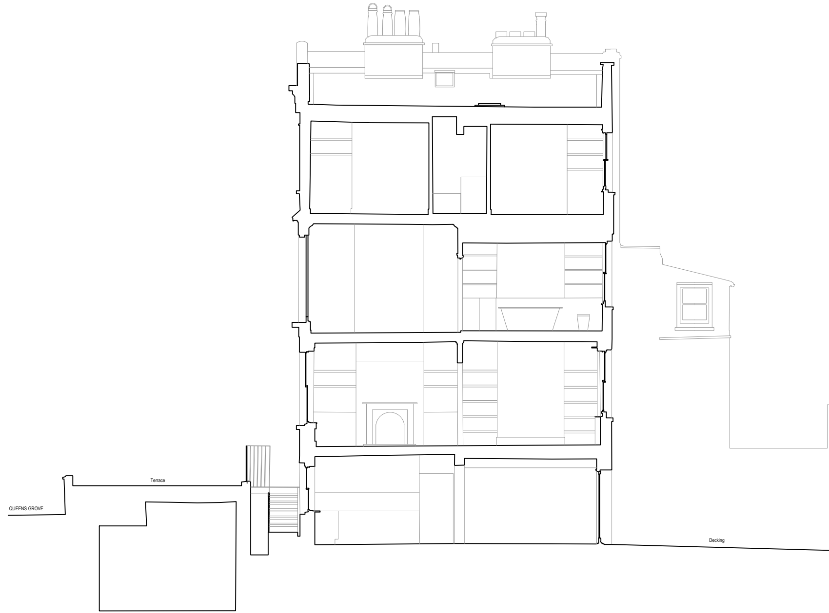
Existing Section AA Scale 1:100 @ A3