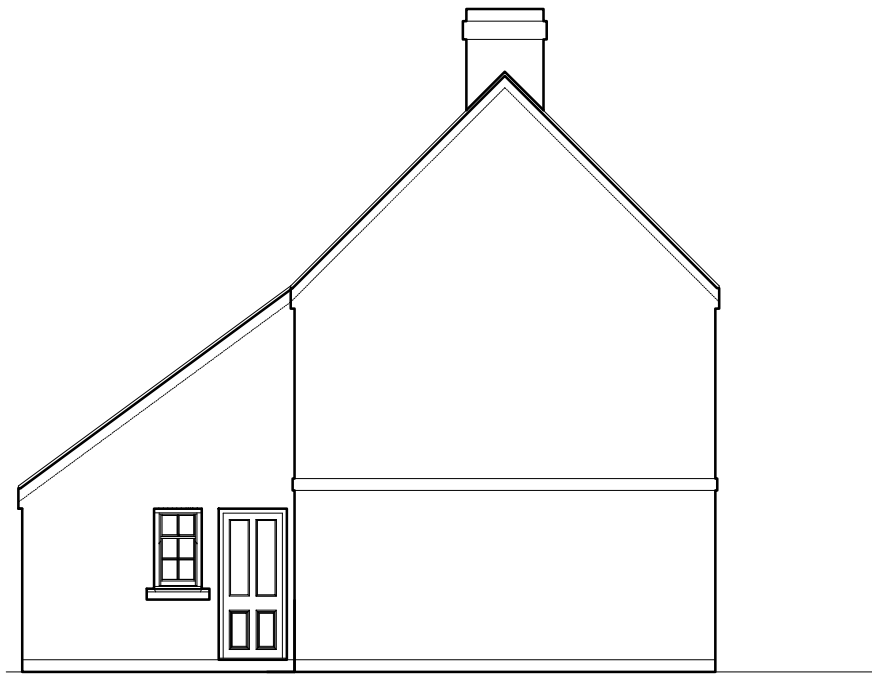
Proposed gable elevation

Figured dimensions to be taken in preference to scaled dimensions. All dimensions to be checked on site by the main contractor and any discrepancies found to be reported to M.J. Design Services. This drawing is the copyright of M.J. Design Services