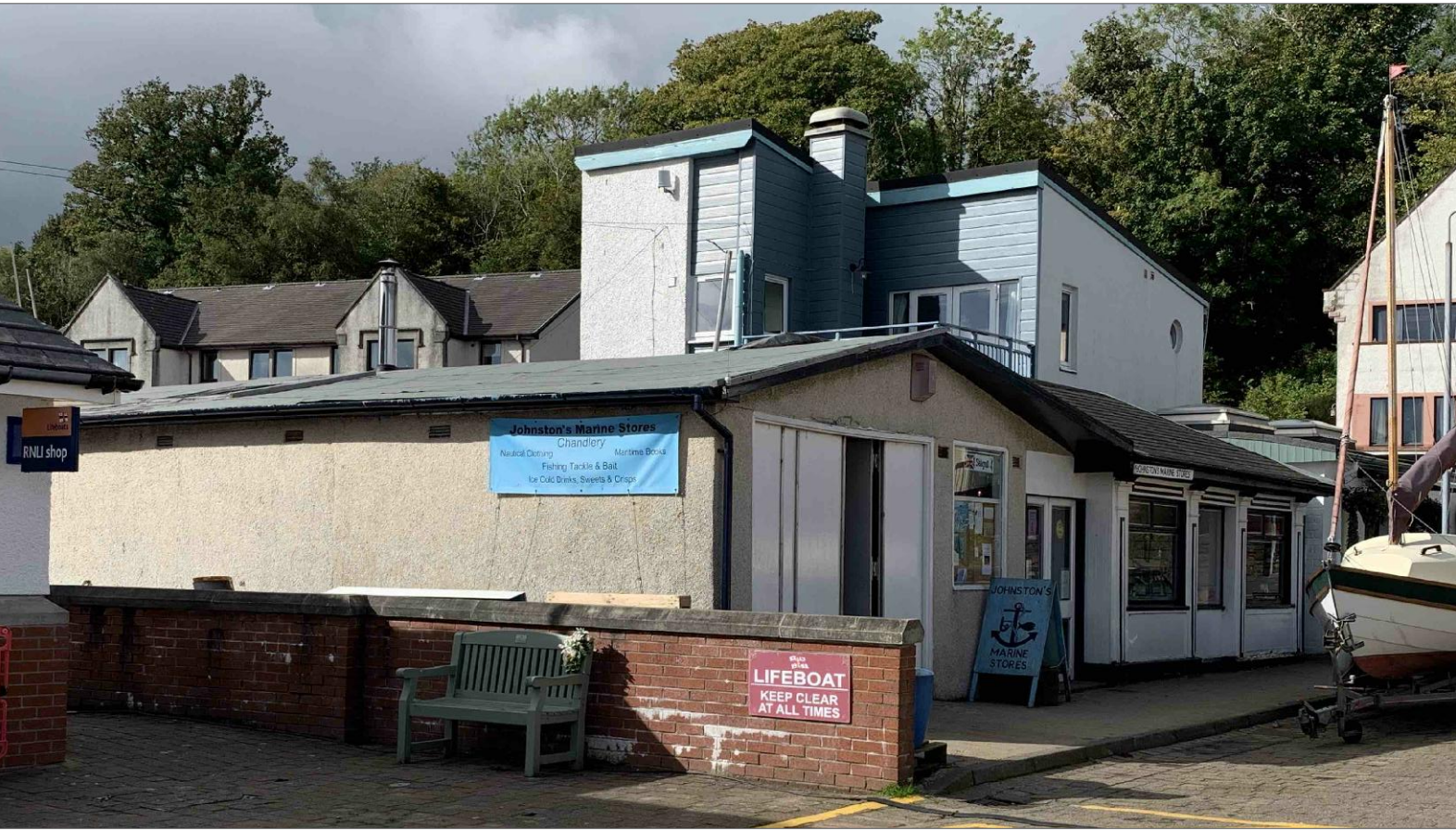
South Eastern Elevation