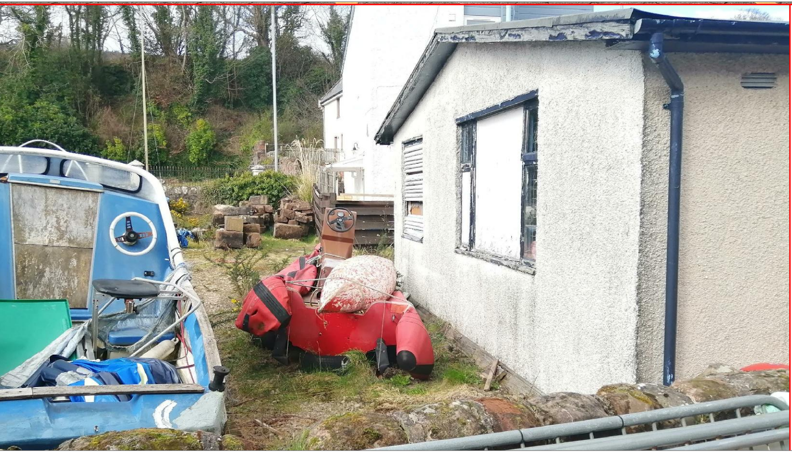
South Western Elevation