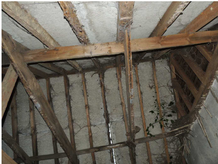
Photo 6: There were no features in the rafters that might be occupied by bats