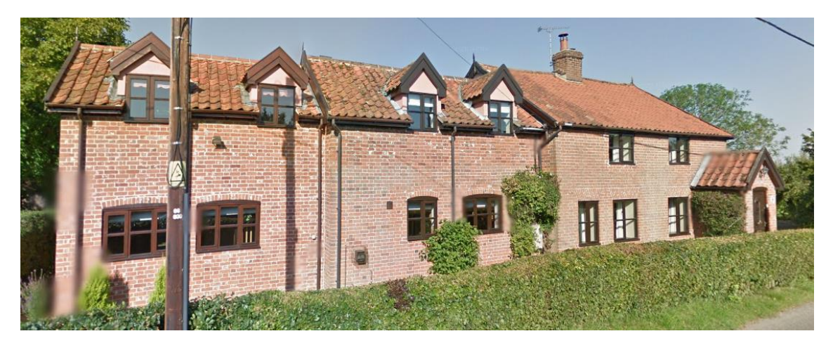
Neighbour The Nook (above) showing long frontage and set back facades