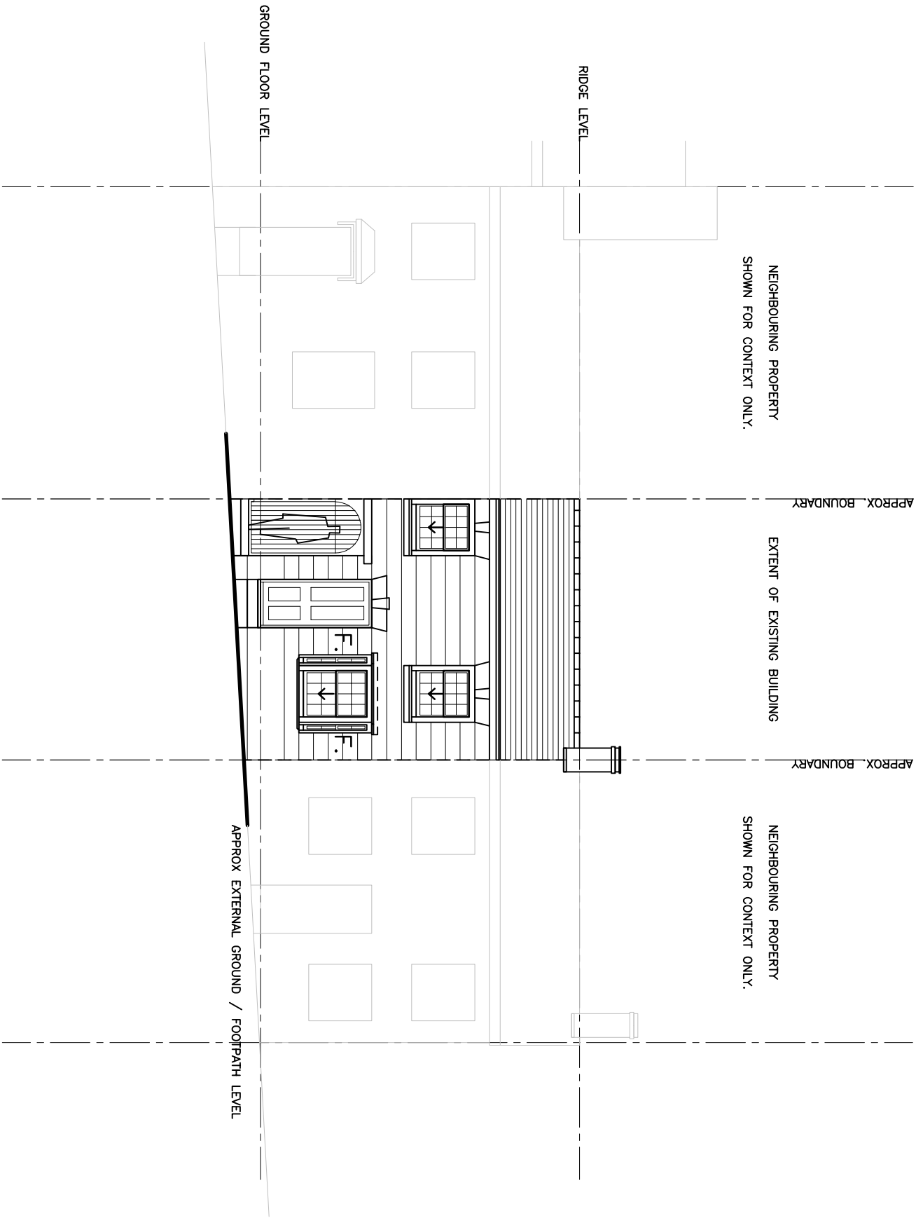
Elevation – 1.

The drawings herewith described are prepared from a visual inspection of the property and thus the accuracy of the information shown cannot be guaranteed. The drawings are therefore for information only, to describe the intent of the works and are subject to a measured survey prior to manufacture.