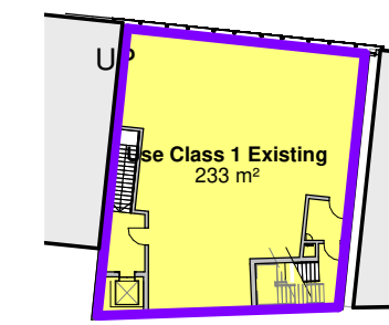
3 Union Street Level 01 1 : 500