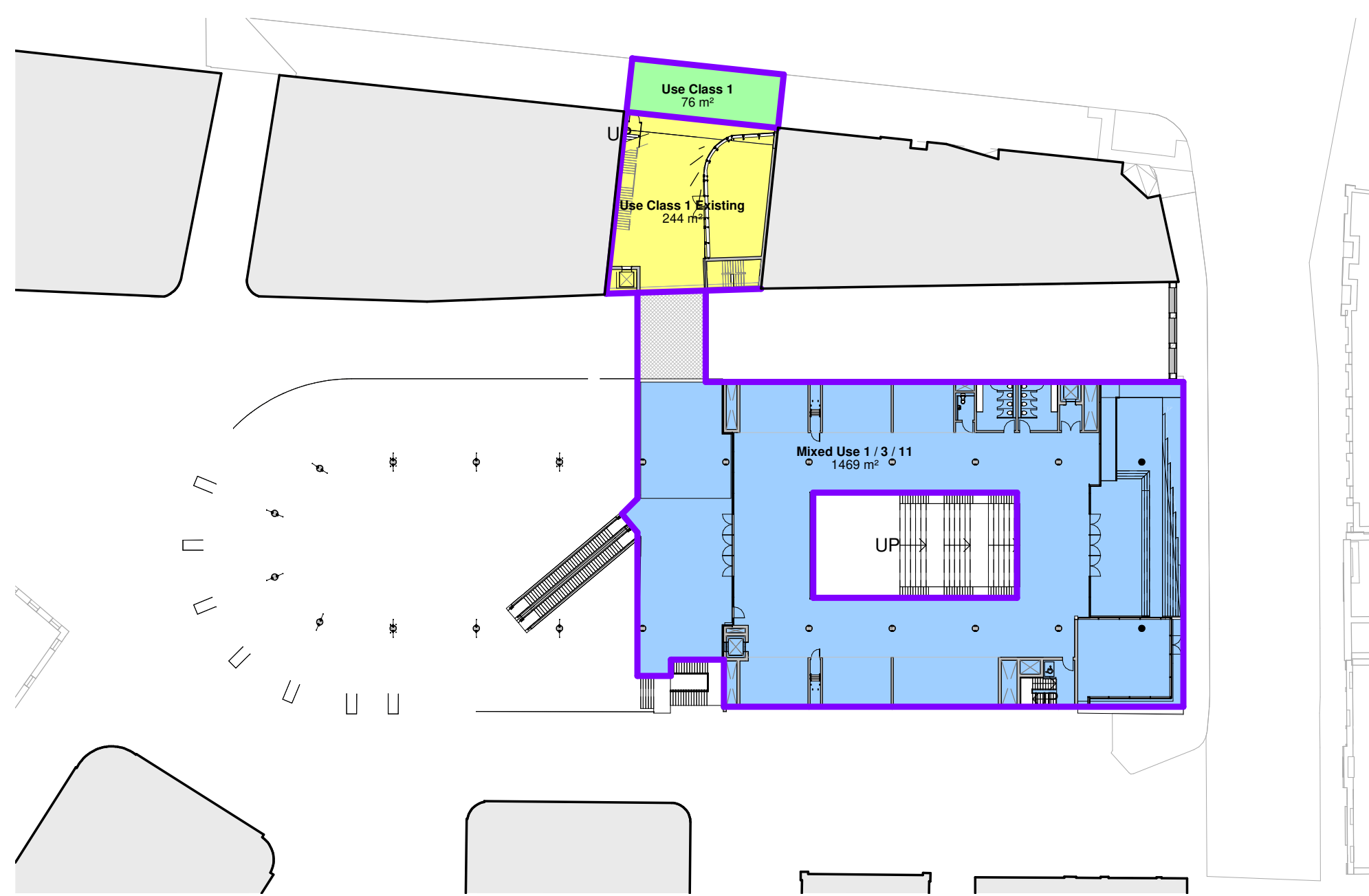
2 Upper Market 1 : 500