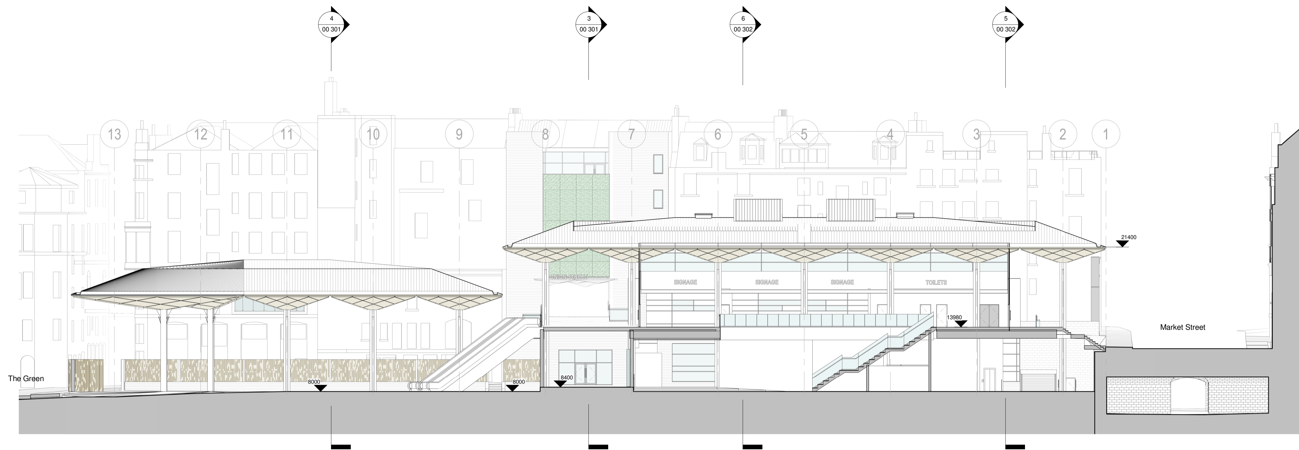
1 General Arrangement Section 1 1 : 200