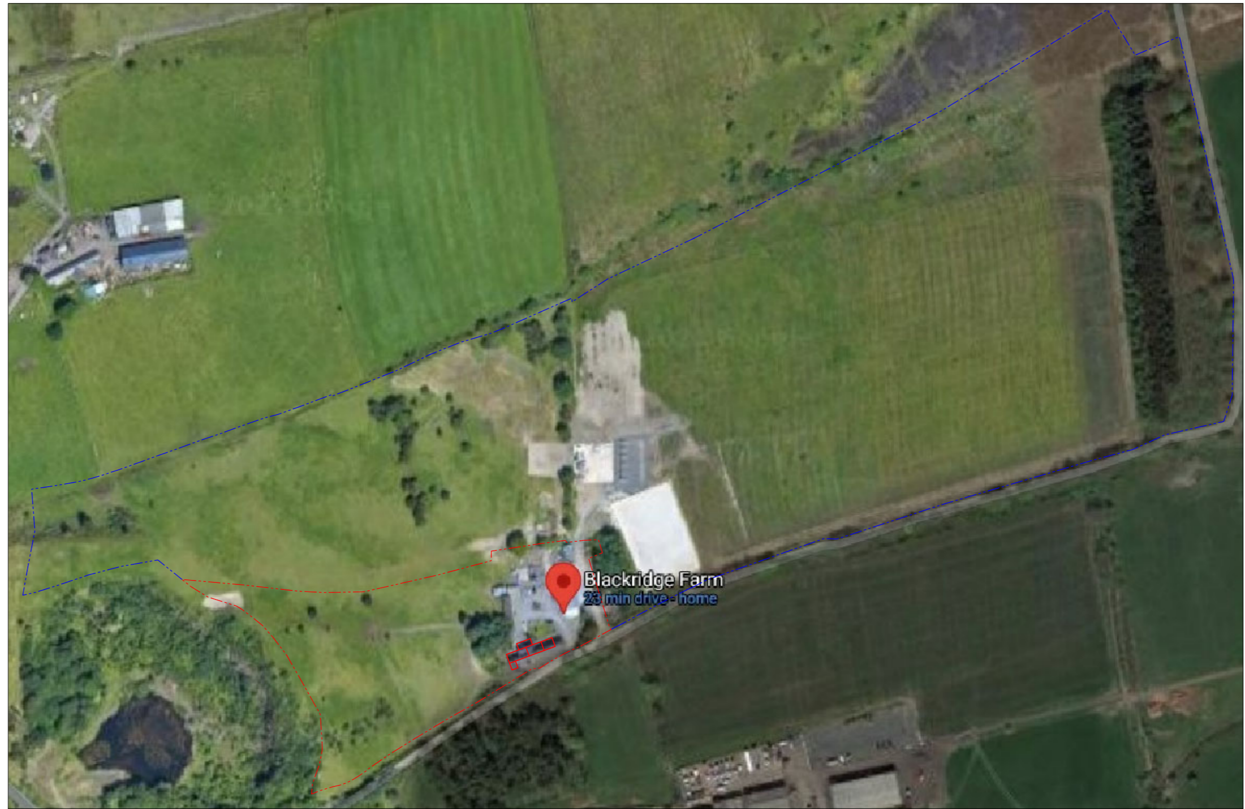
Site Plan 1:2500