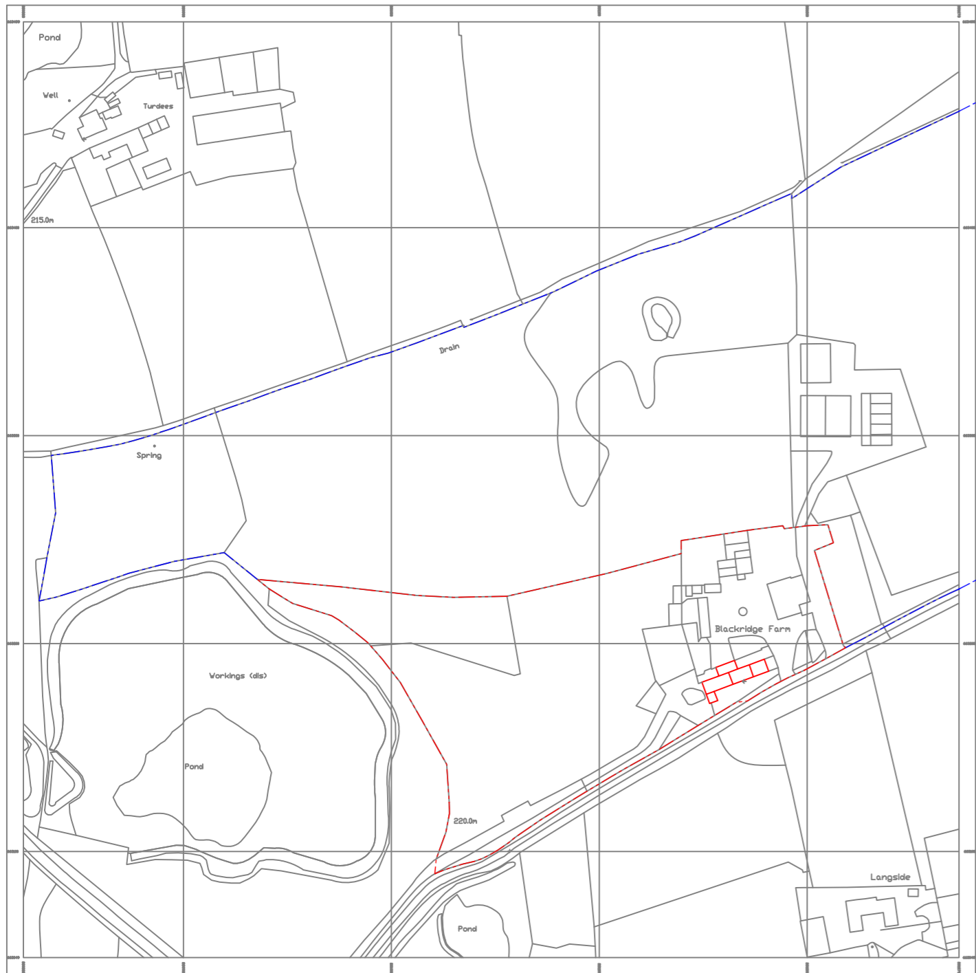
OS Plan 1:2500