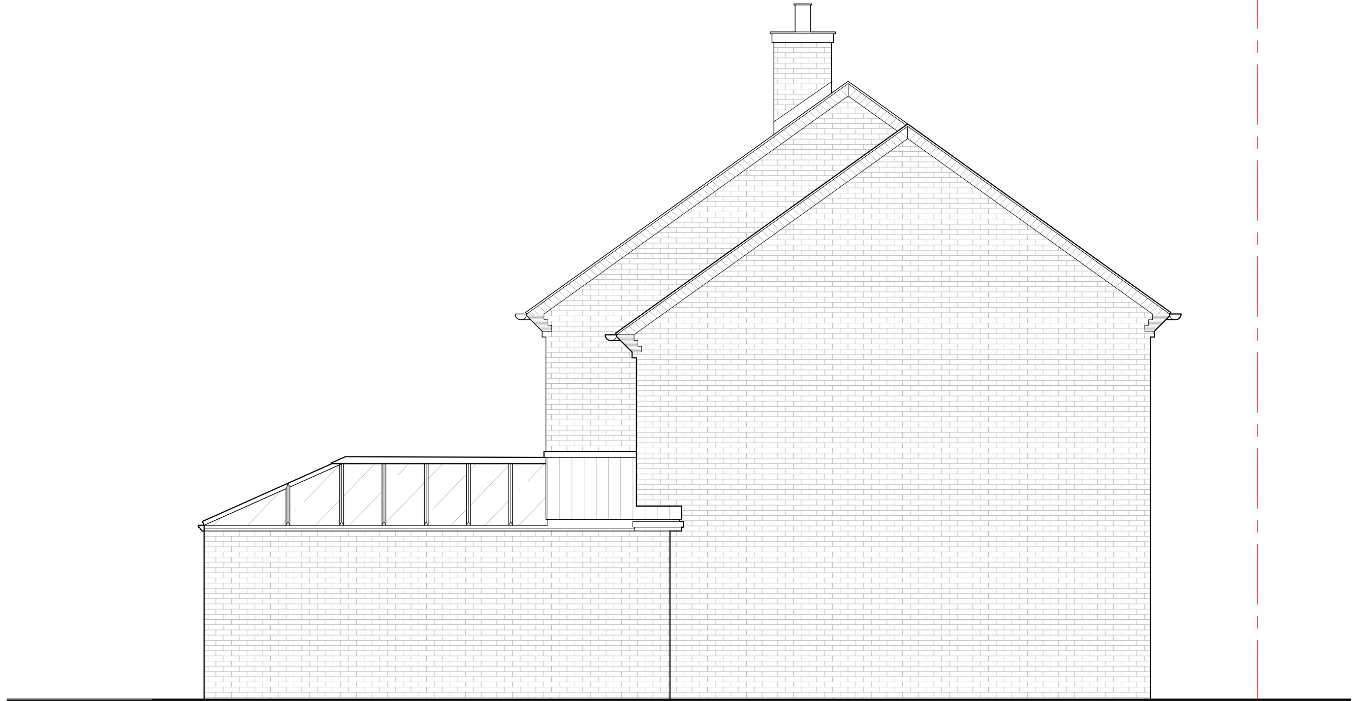
Existing Side North West Elevation Scale 1:50 @ A3