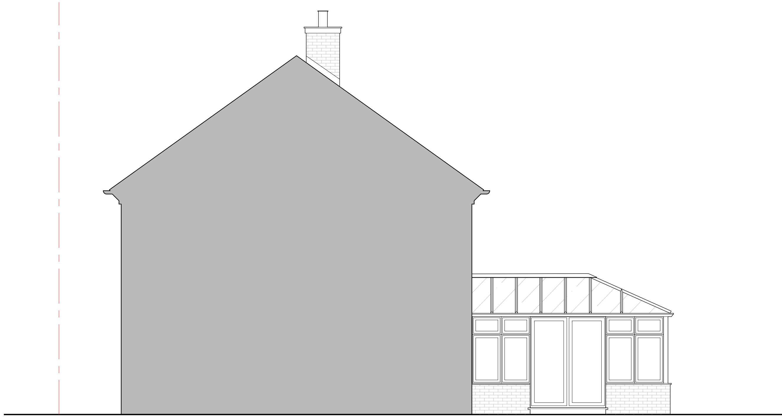
Existing Side South East Elevation Scale 1:50 @ A3