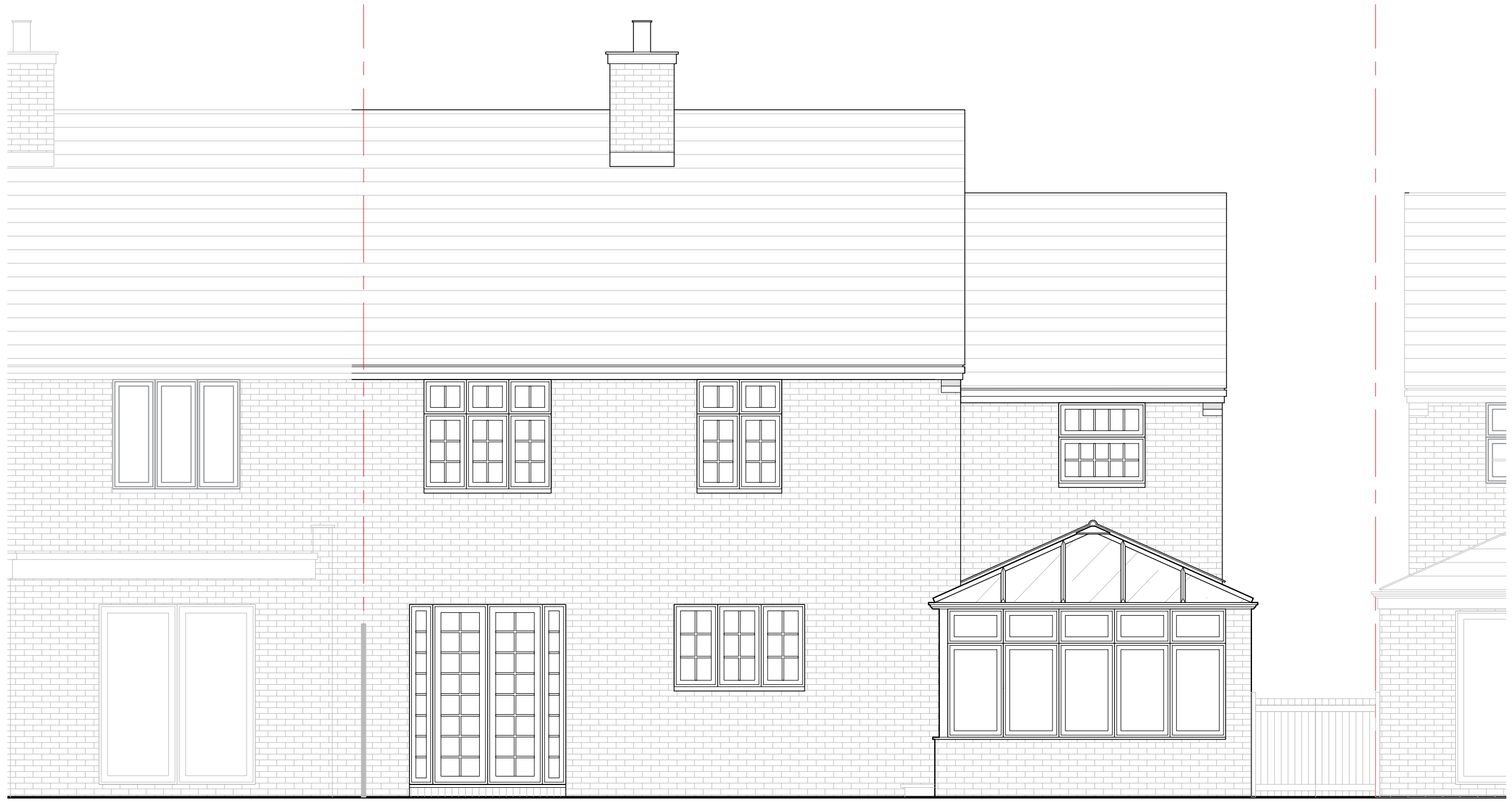
Existing Rear North East Elevation Scale 1:50 @ A3