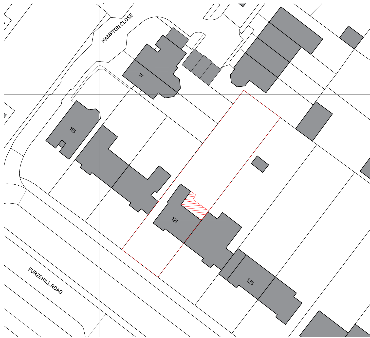
Block Plan Scale 1:500 @ A3