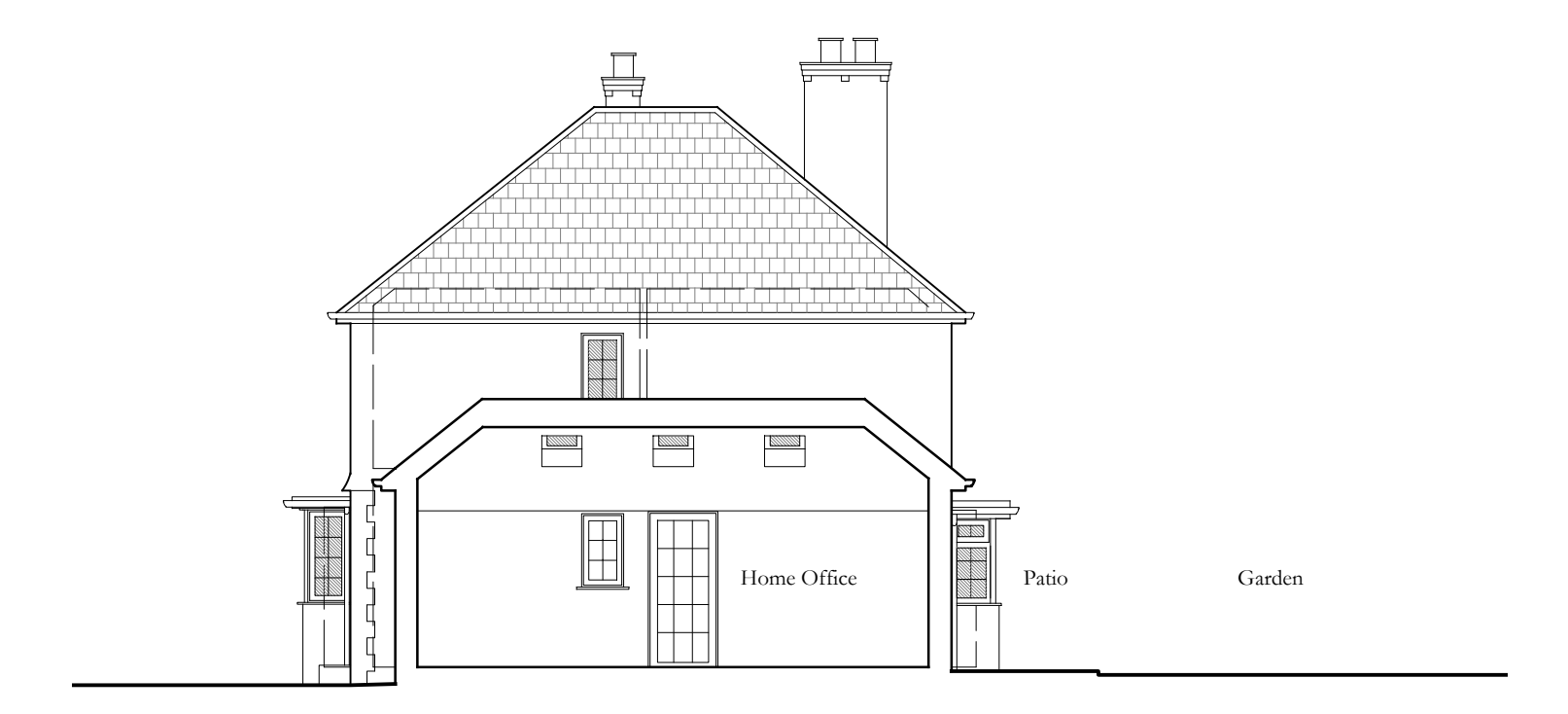
PROPOSED SECTION A-A Scale 1:100