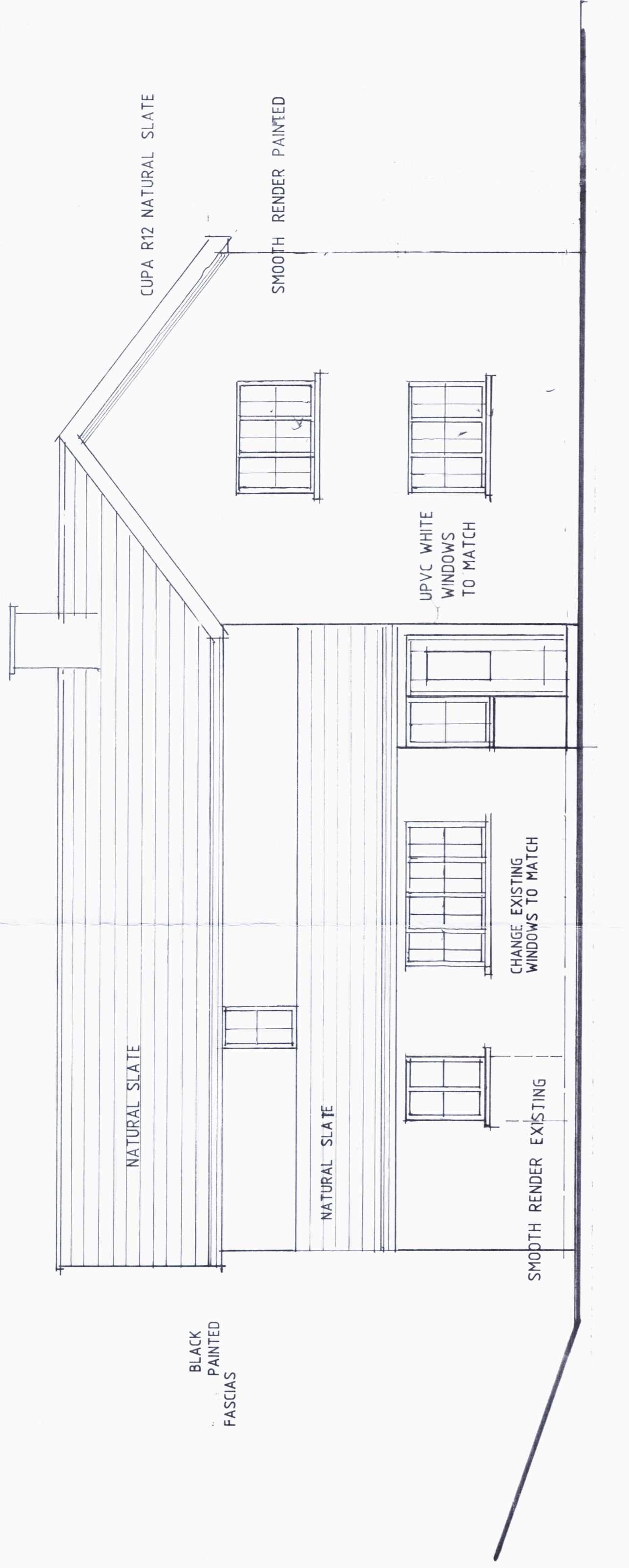
PROPOSED NW ELEVATION