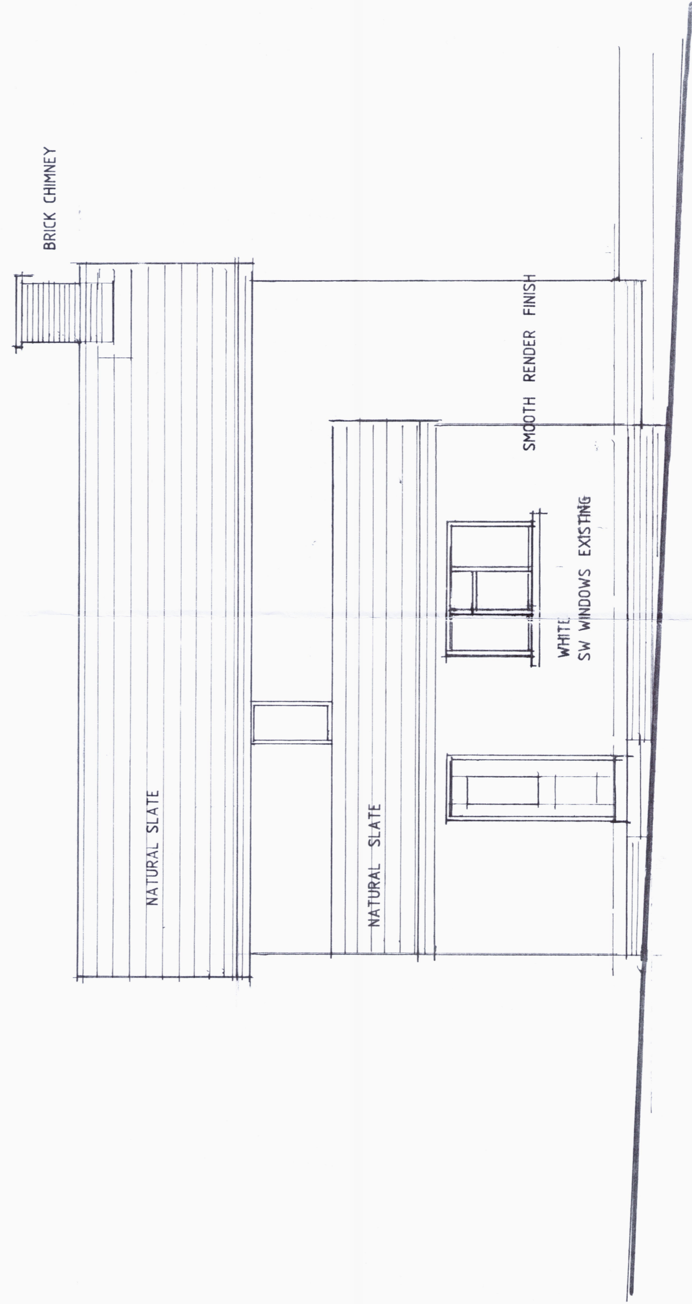
EXISTING NW ELEVATION