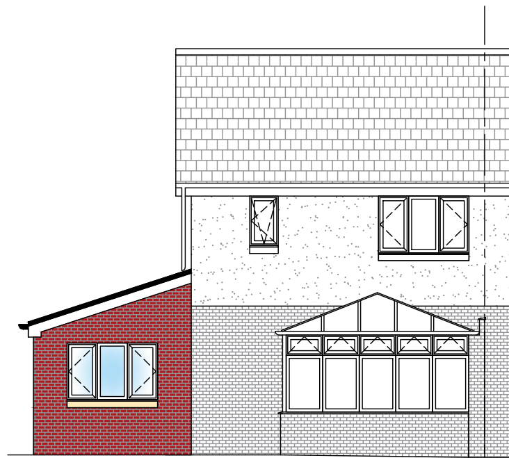
PROPOSED REAR ELEVATION SCALE - 1:100