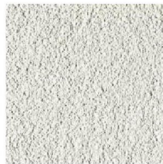
2. WHITE RENDER FINISH CASEA MINERAL FINISH COAT - K (OR SIMILAR)