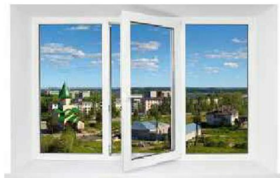
3. UPVC WINDOWS, FRAMES: WHITE, WINDOW DESIGN TO MATCH THE REST OF THE BUILDING