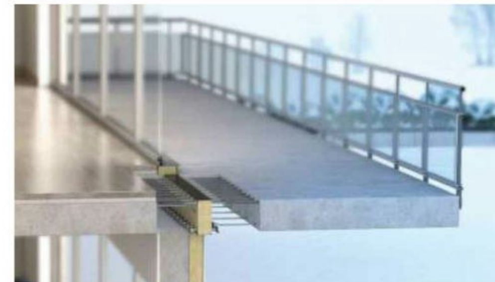
7. CONCRETE BALCONY FLOOR TO MATCH EXISTING, ANTI-SLIP FINISH