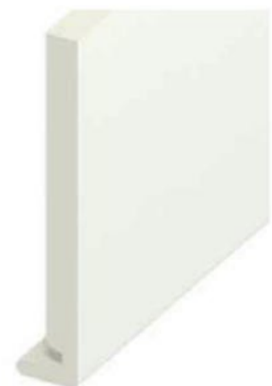
1. FASCIA BOARD PAINTED WHITE TO MATCH THE REST OF THE BUILDING