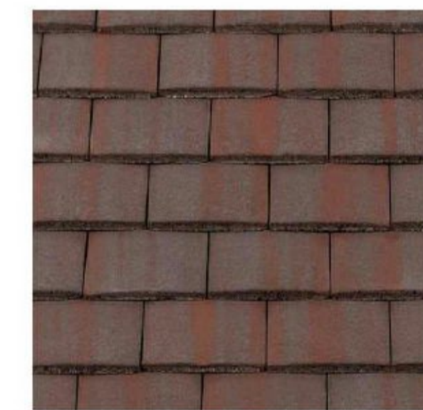
5. HUNG TILE TO AREA UNDER WINDOW, COLOUR AND STYLE TO MATCH THE HUNG TILE ON REST OF THE BUILDING PRODUCT SPECIFICATION: REDLAND PLAIN TILE - BRECKLAND BROWN (OR SIMILAR, CLOSE MATCH TO EXISTING)