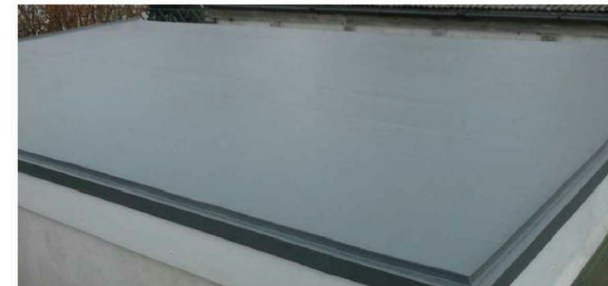
8. SINGLE PLY MEMBRANE TO FLAT ROOF, COLOUR: GREY