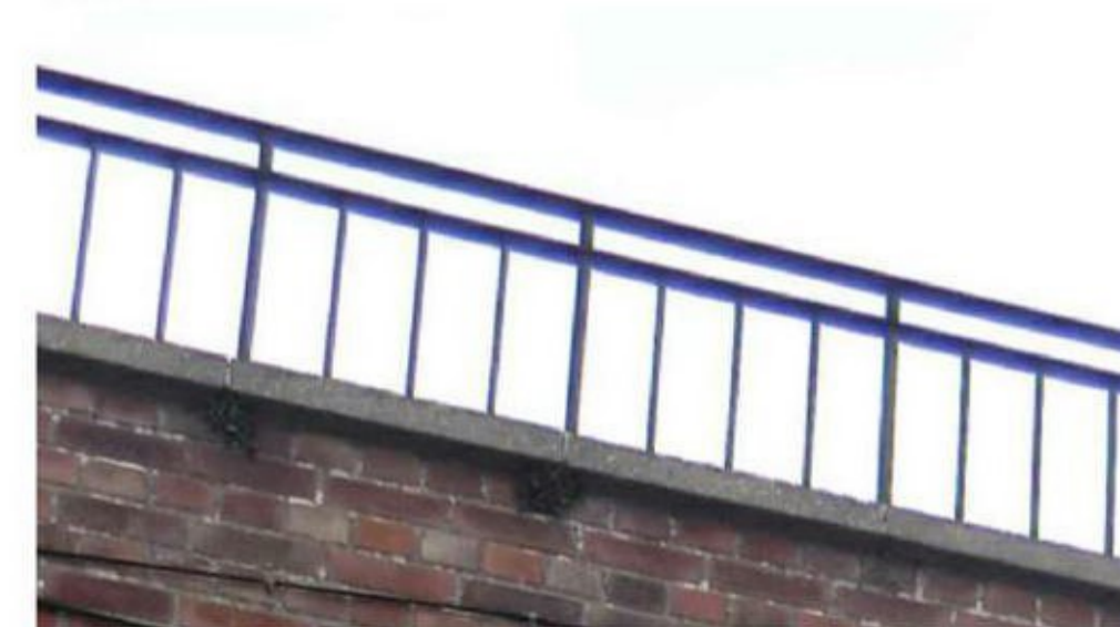
6. METAL RAILING PANTED BLACK, DESIGN TO MATCH EXISTING