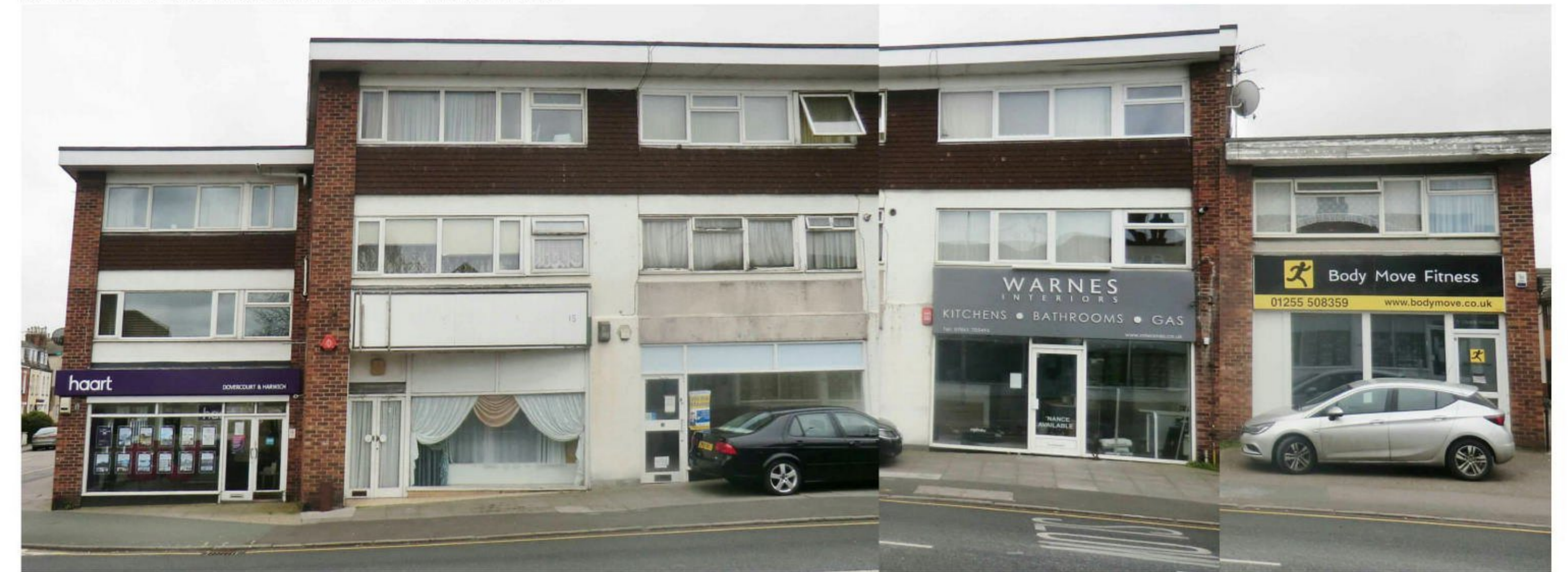
REFERENCE PHOTOS: FRONT AND REAR ELEVATION OF EXISTING BUILDING