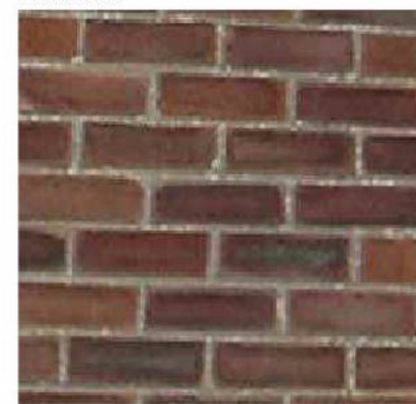
4. RED BRICK TO MATCH EXISTING WIENERBERGER FACING BRICK OAKWOOD MULTI - PACK OF 400 (OR SIMILAR, CLOSE MATCH TO EXISTING)