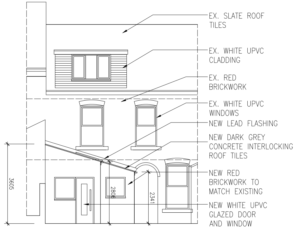
REAR ELEVATION SCALE 1:100 @A3