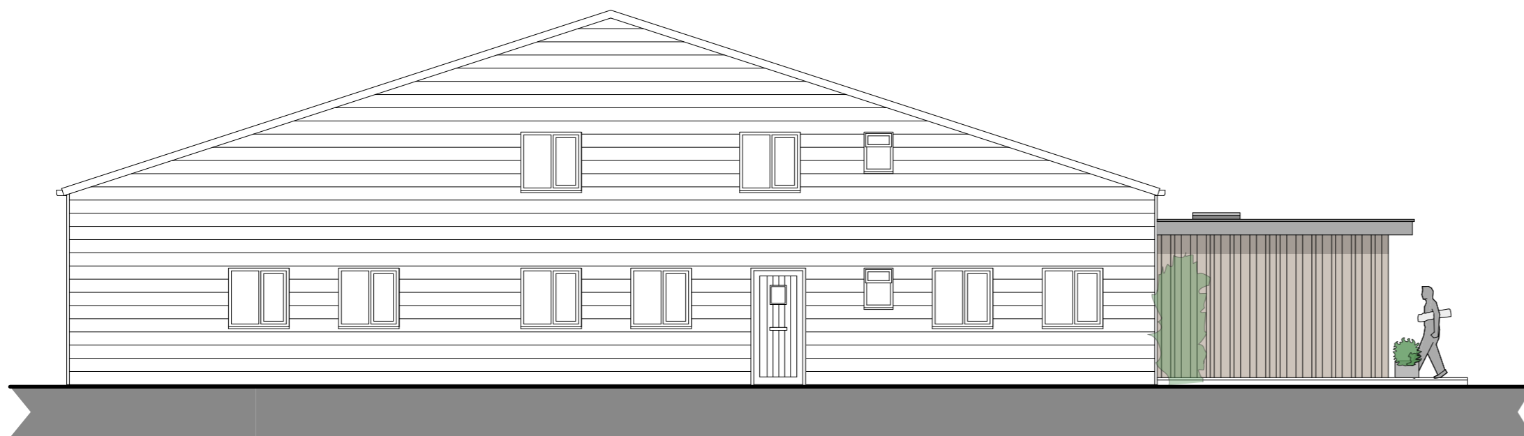
South East Elevation 1:100