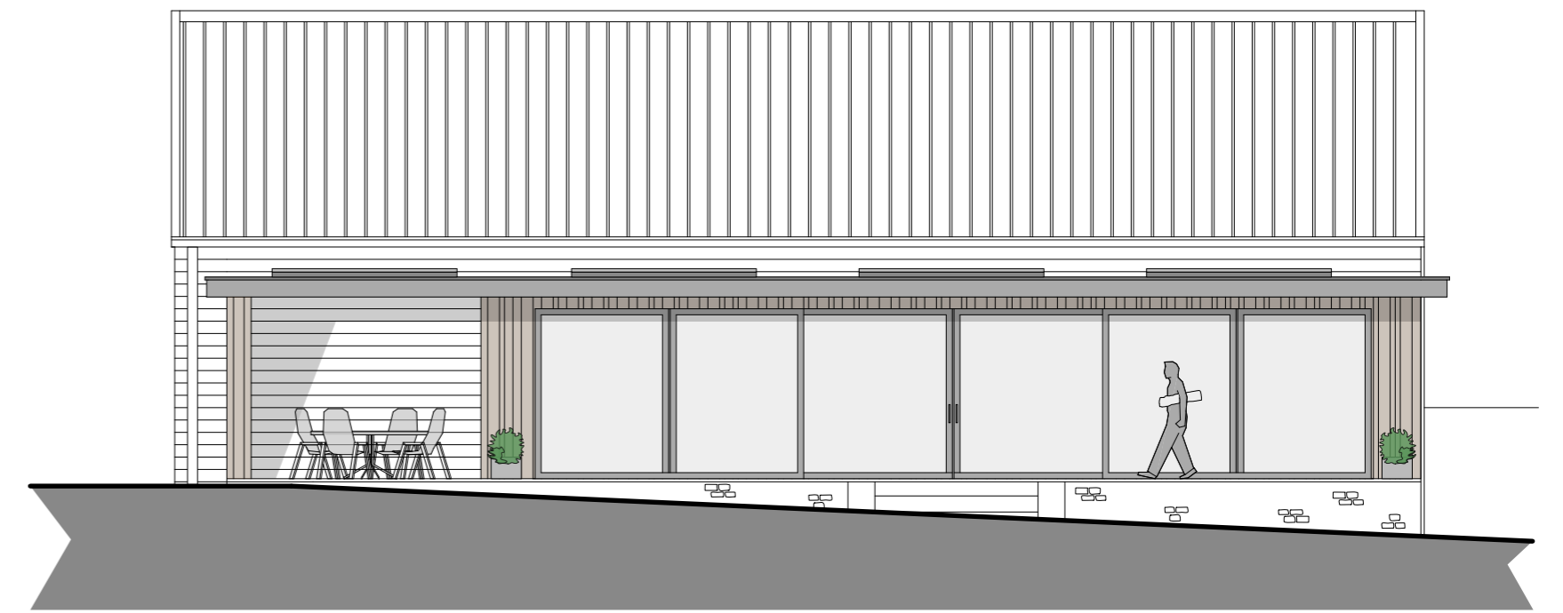
North East Elevation 1:100