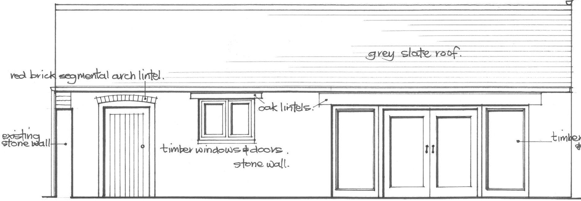
EAST COURTYARD GARDEN ELEVATION - AS PROPOSED 1:50.