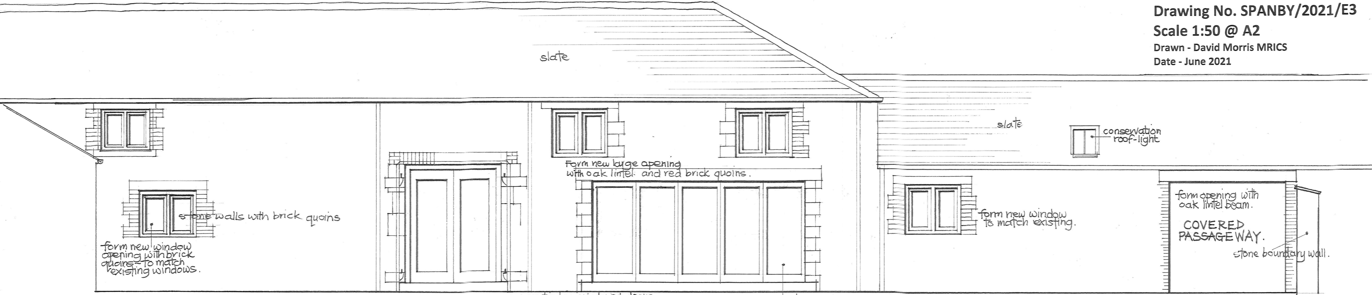
SOUTH ELEVATION - AS PROPOSED 1:50

ELEVATIONS - AS PROPOSED (1 of 2) Drawing No. SPANBY/2021/E3 Scale 1:50 @ A2 Drawn - David Morris MRICS Date - June 2021