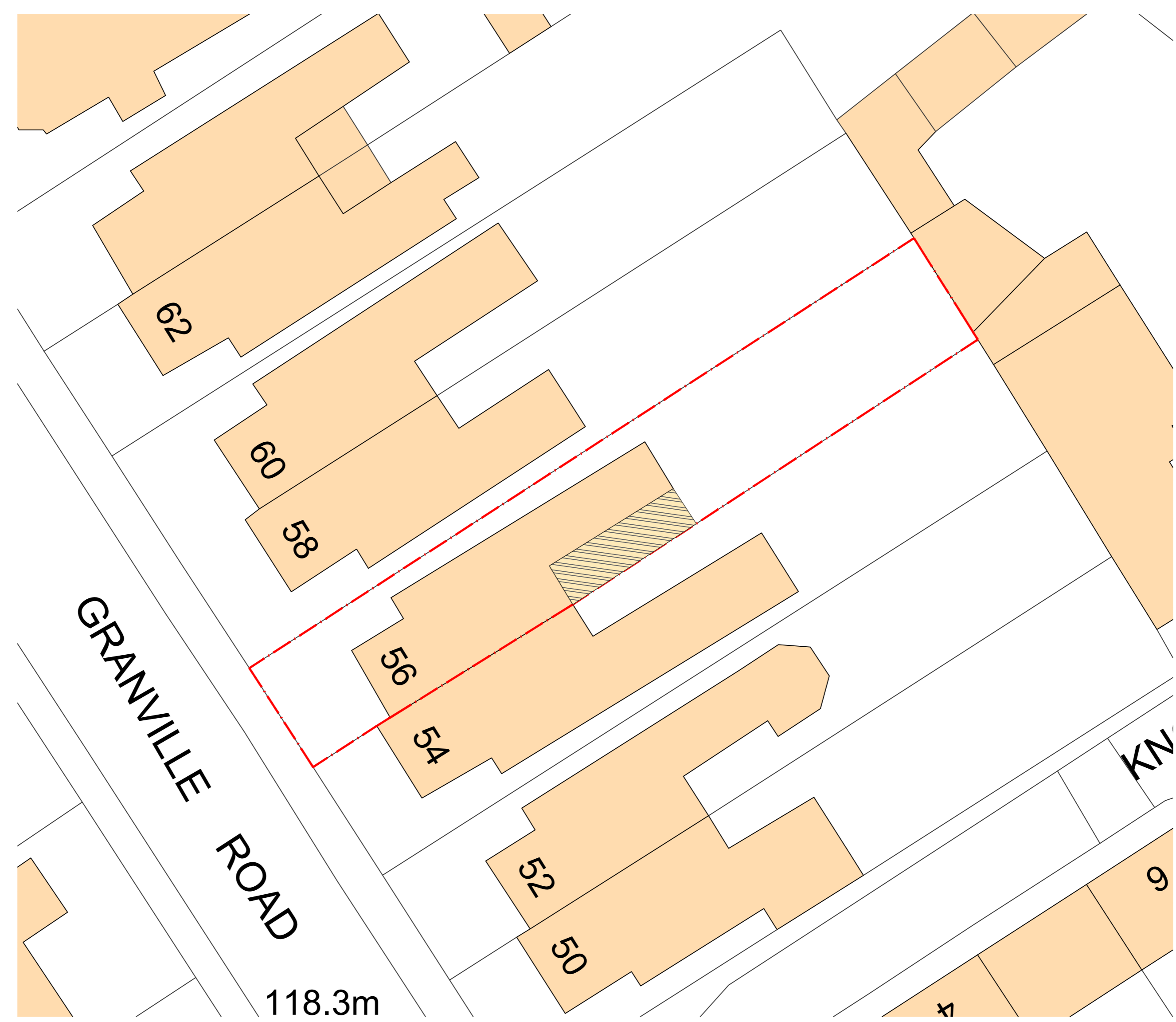
PROPOSED BLOCK PLAN SCALE: 1:200