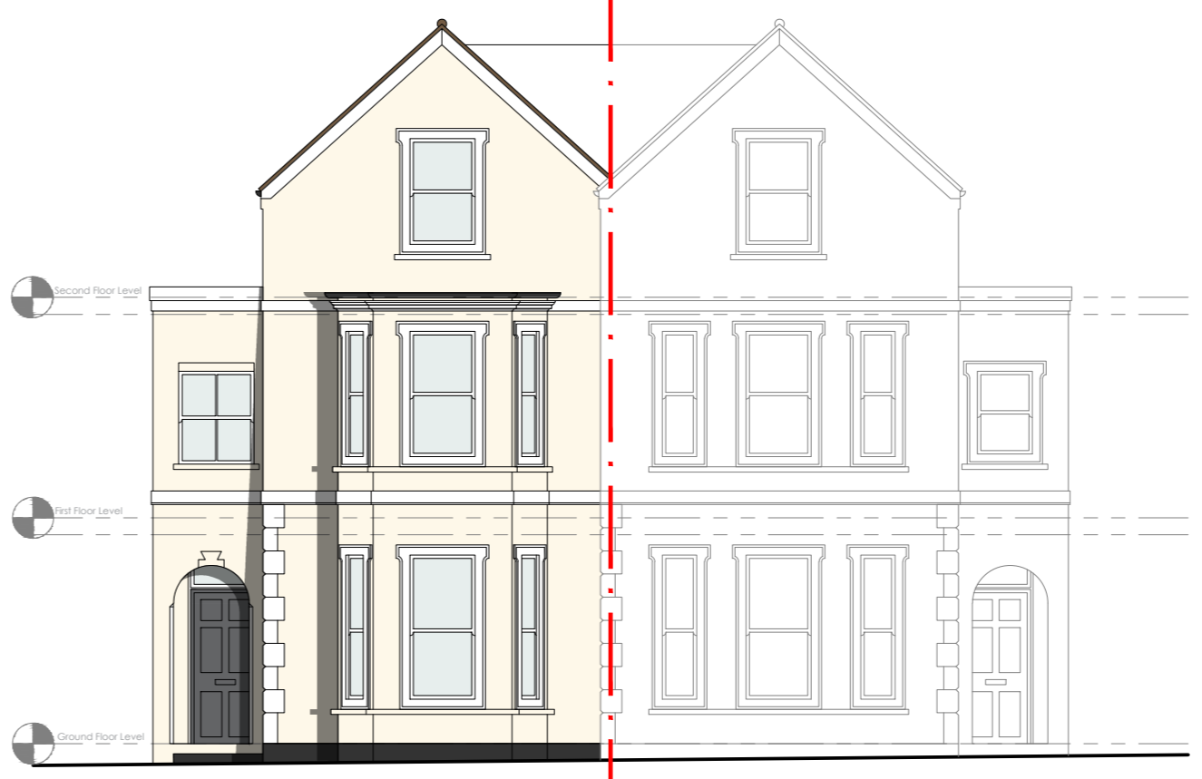
FRONT ELEVATION (WEST)