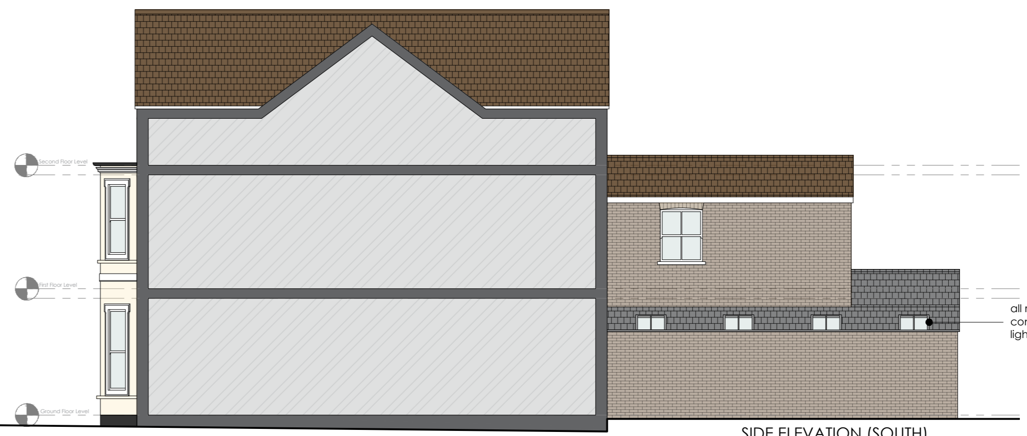
SIDE ELEVATION (SOUTH)