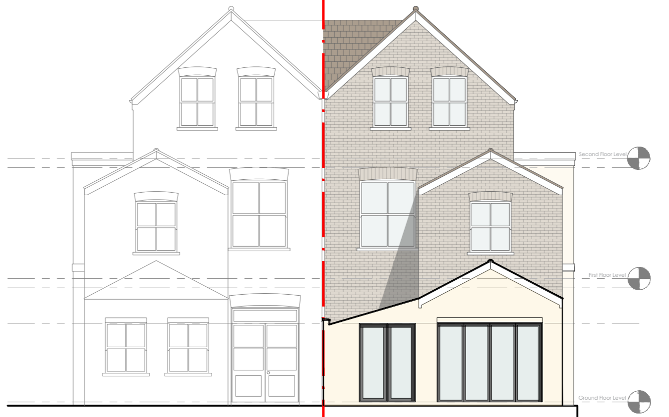
REAR ELEVATION (EAST)