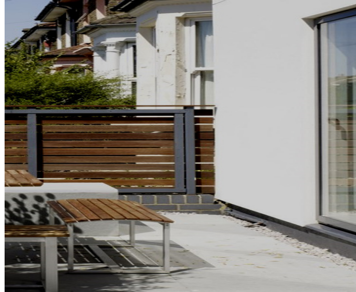
a OFF WHITE THROUGH COLOUR RENDER