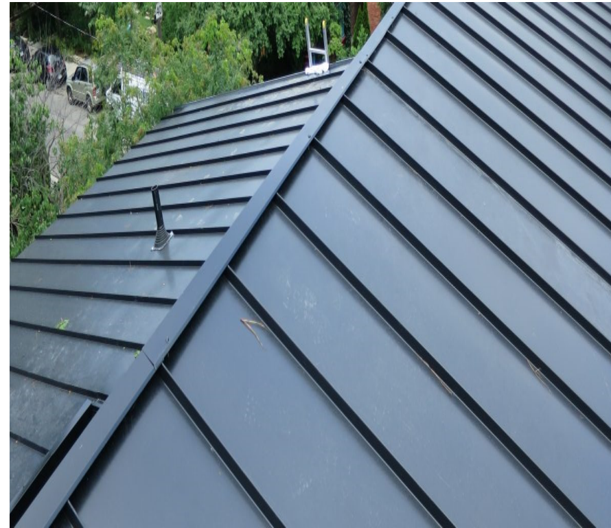
b STANDING SEAM ROOF COVERING GREY