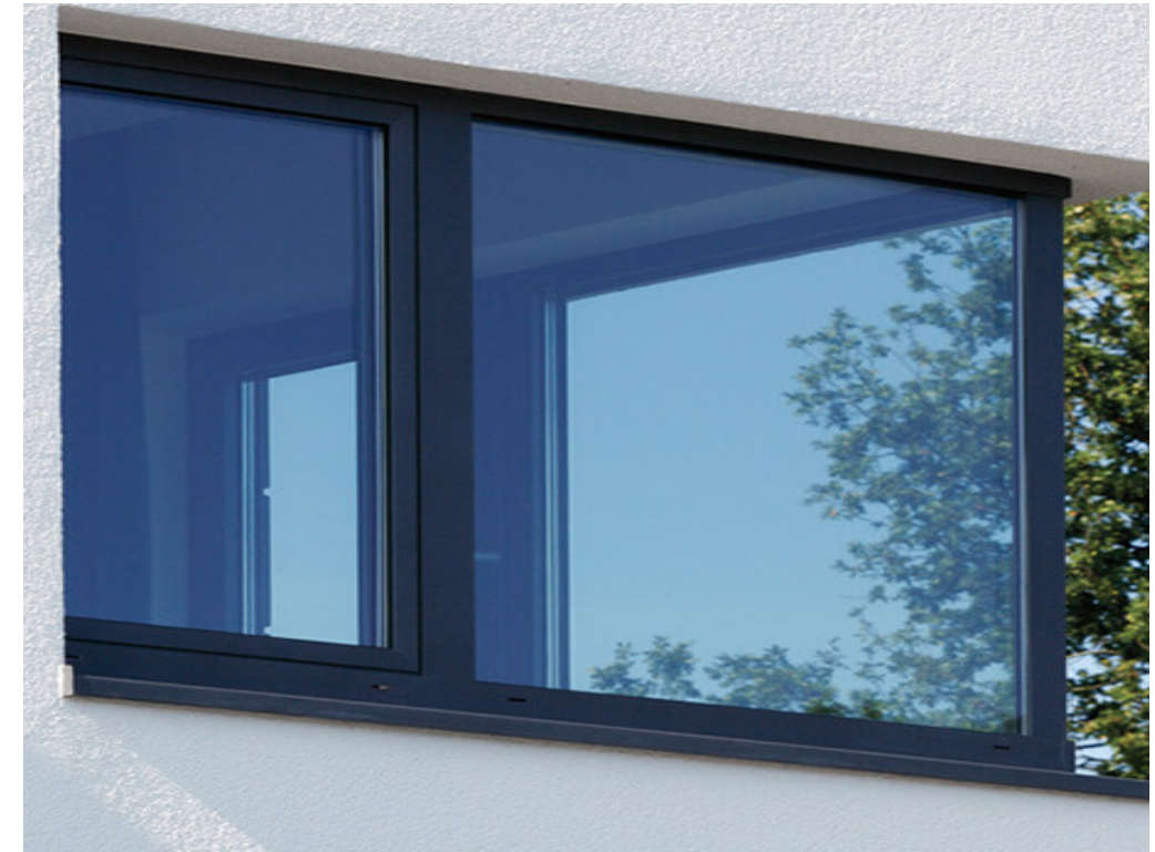
c METAL FRAMED WINDOWS & DOORS