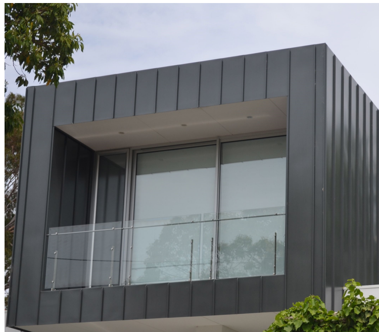
d STANDING SEAM WALL COVERING GREY