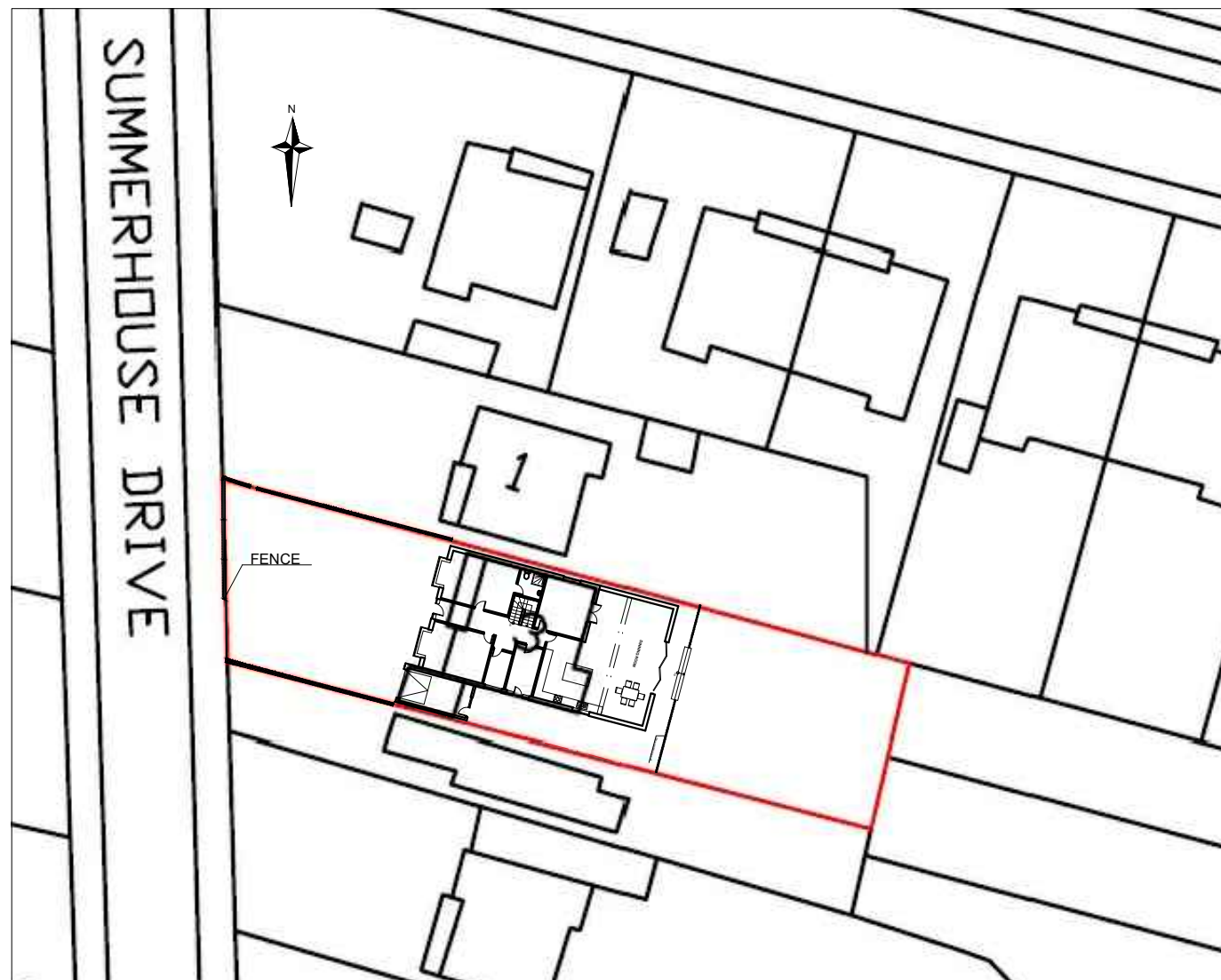
BLOCK PLAN SCALE-1:500

MATCHING MATERIALS TO BE USED FOR EXTENSION AND LOFT. DORMER FACE AND CHEEKS TO BE TILE HUNG WITH MATERIALS TO MATCH EXISTING. ALL DIMENSIONS IN MILLIMETRES & TO BE CHECKED ON SITE PRIOR TO COMMENCEMENT OF ANY BUILDING WORKS. FOR EXTENSION TO HABITABLE ROOFSPACE INVOLVING DEMOLITION OF EXISTING SIDE ELEMENT. THIS DRAWING IS THE COPYRIGHT OF REHAL PLANNING. IT MUST NOT BE COPIED OR REPRODUCED OR USED IN ANY WAY WITHOUT WRITTEN PERMISSION FROM REHAL PLANNING