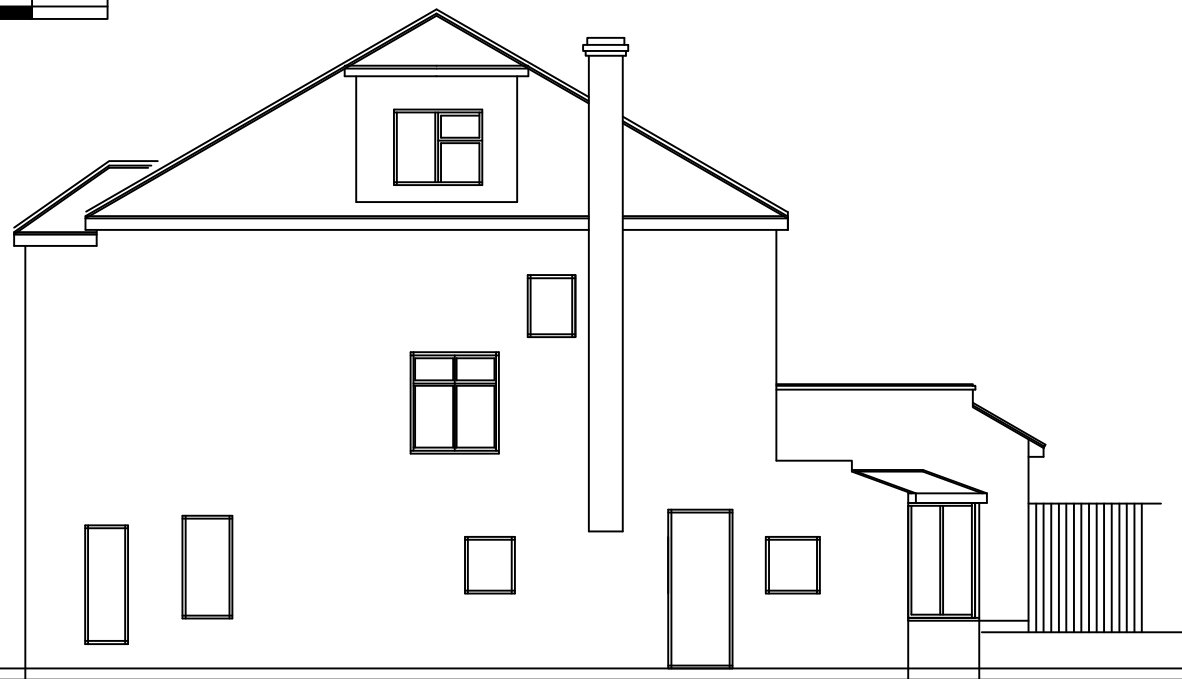
EXISTING SIDE ELEVATION (SOUTH)