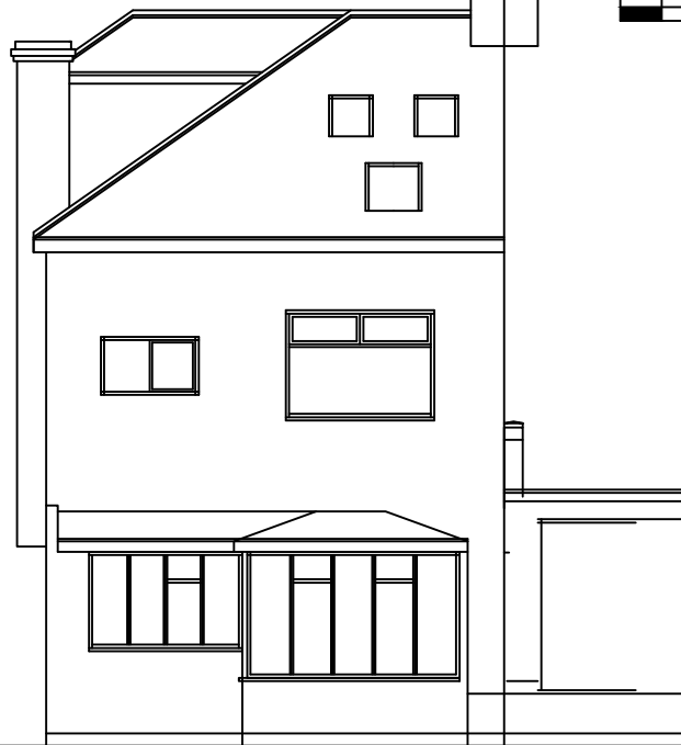
EXISTING REAR ELEVATION (NORTH)