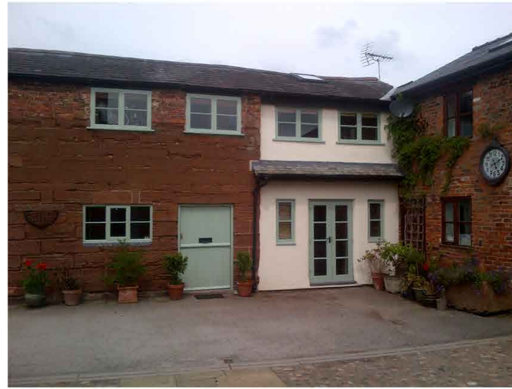
2. The Mews