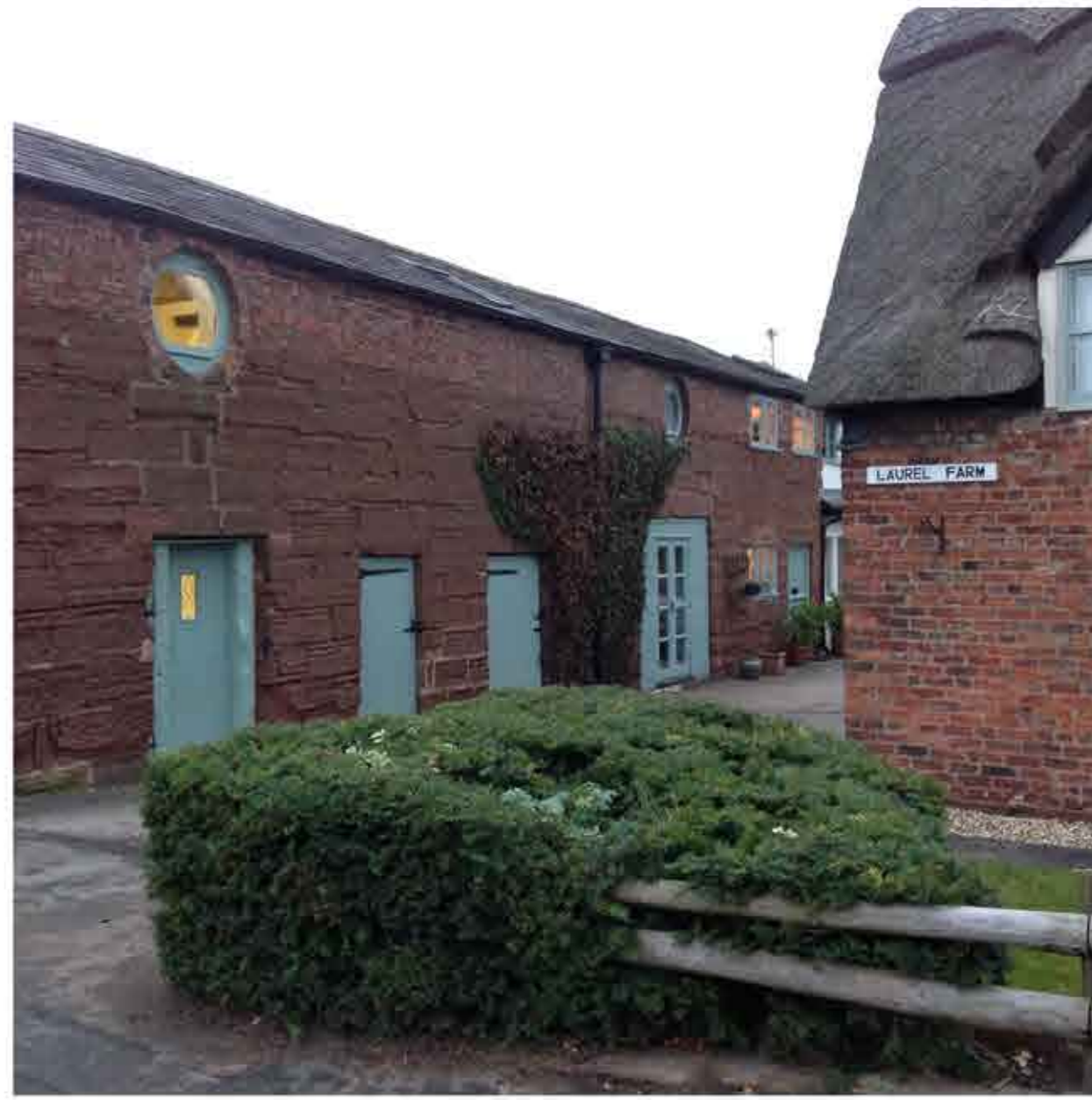
1. The Loft