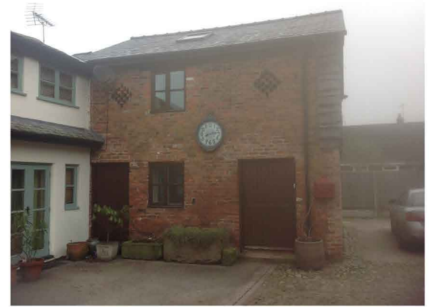
3. The Clock House