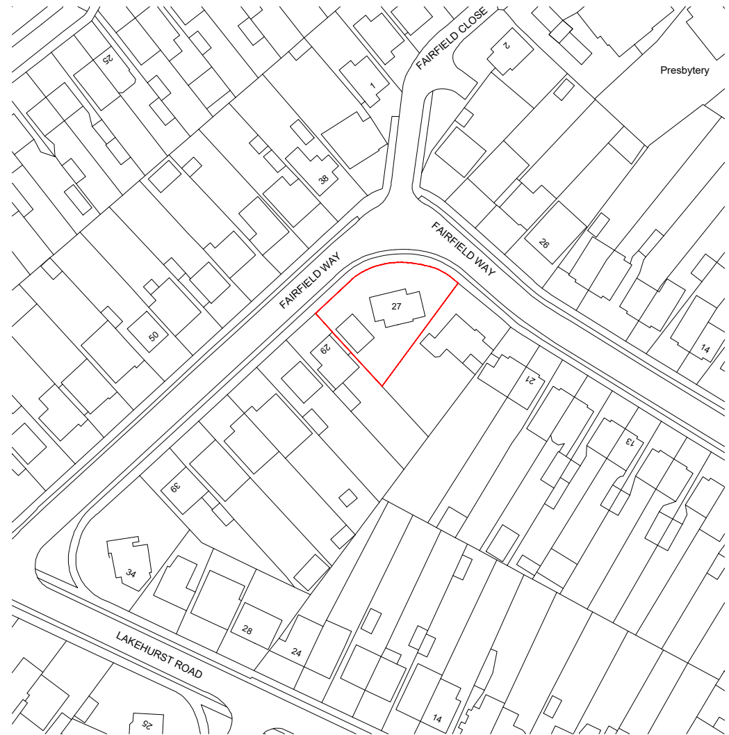
LOCATION PLAN 1:1250 @ A3