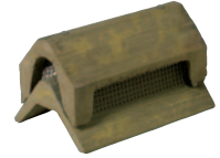
Gas flue ridge unit