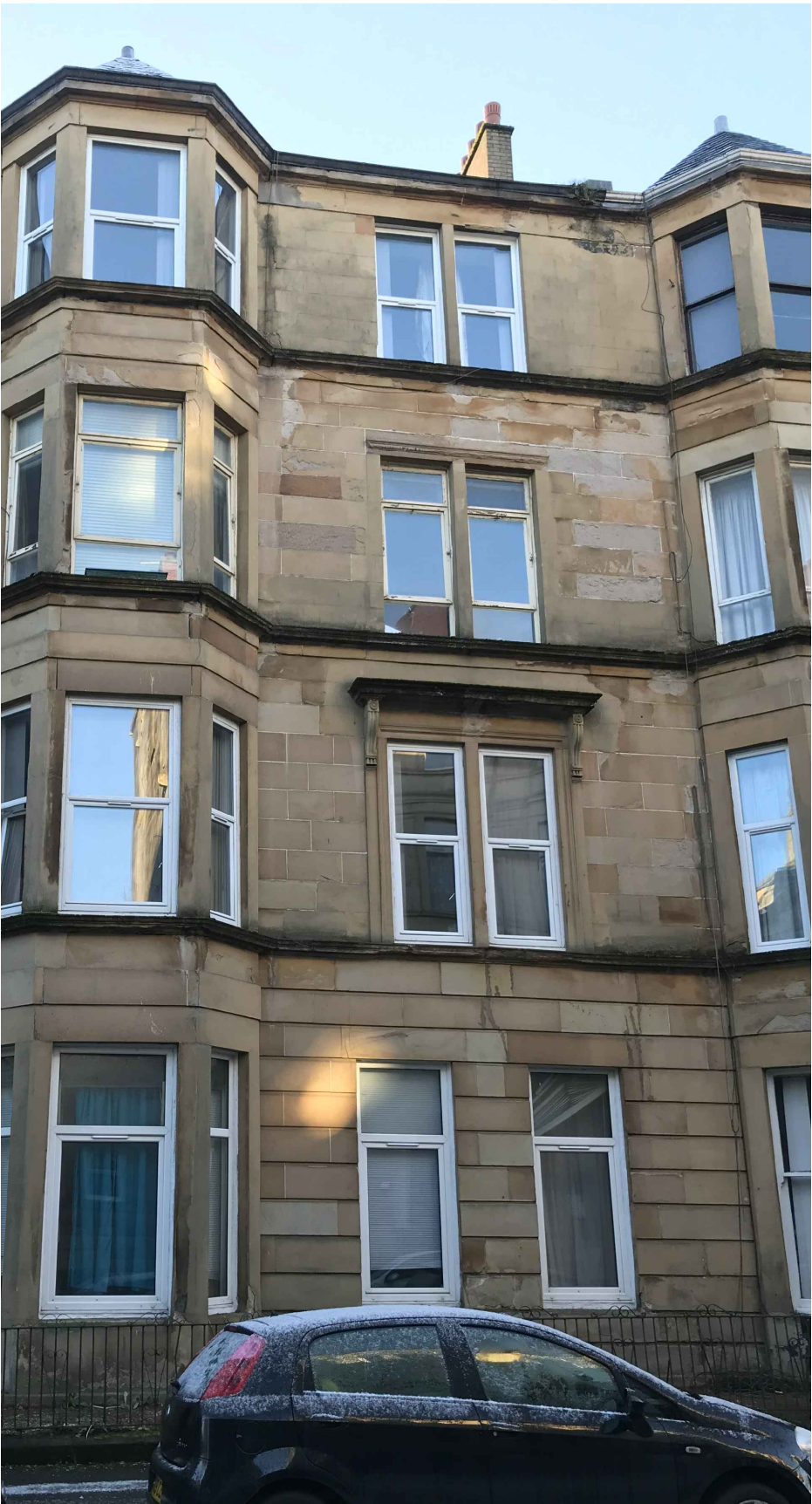
Photo of Existing Facade