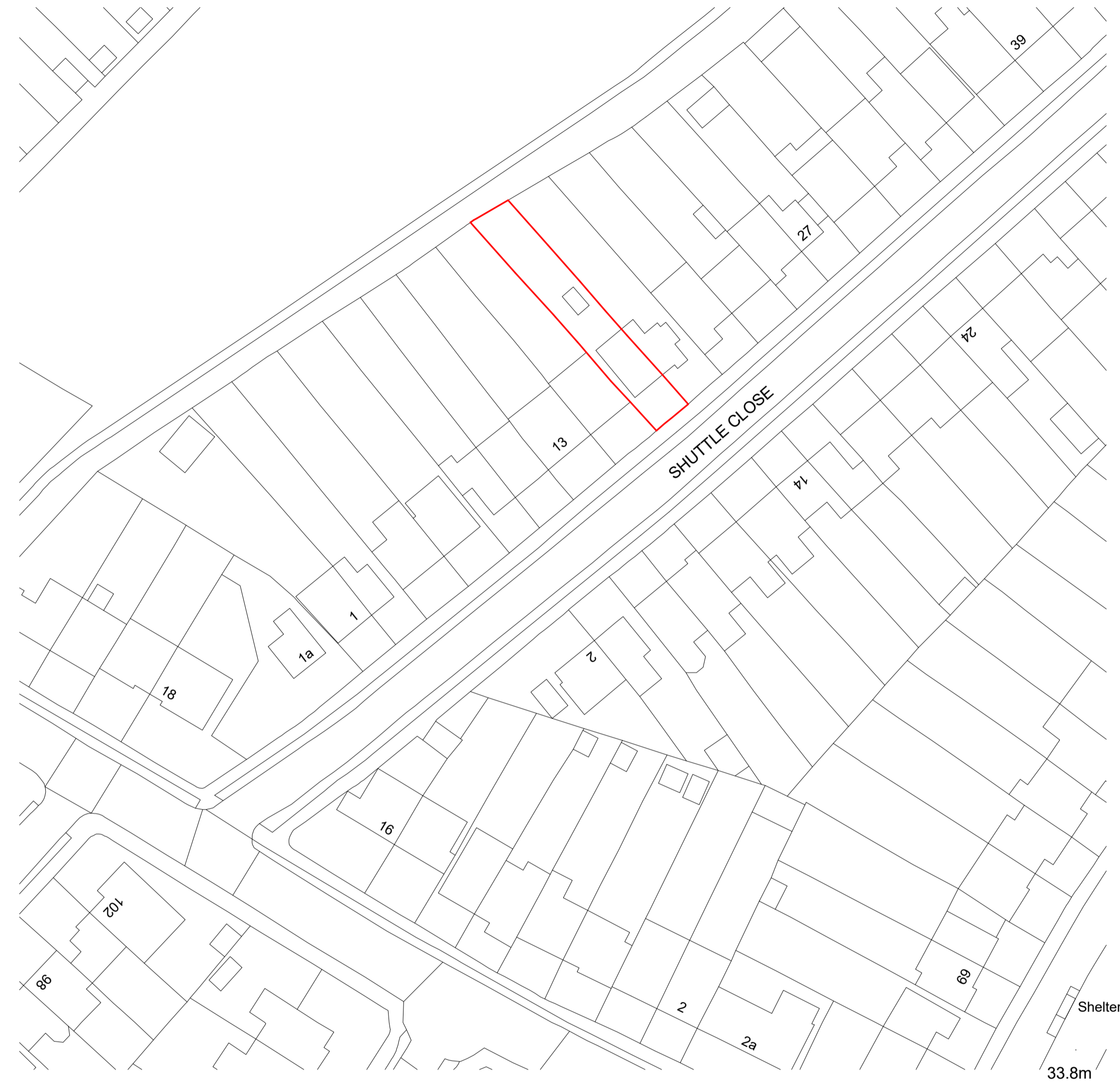
1 Site plan 1-500 Existing 1 : 500