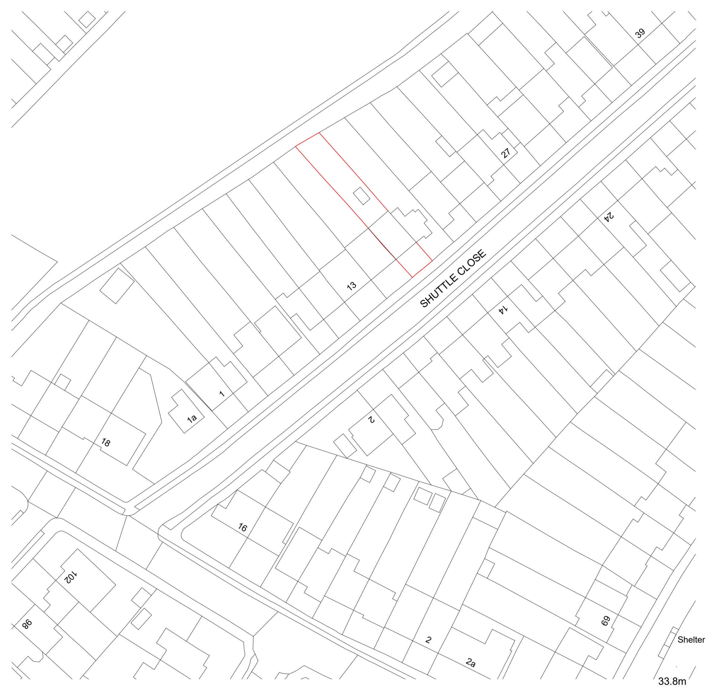
1 Site plan 1-500 Proposed 1 : 500