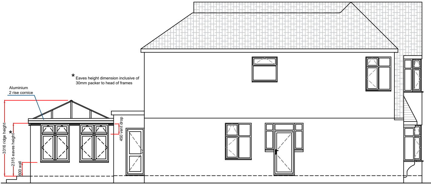
RIGHT-HAND SIDE ELEVATION