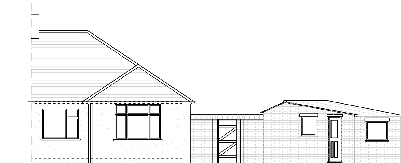
○ Rear Elevation 1:100