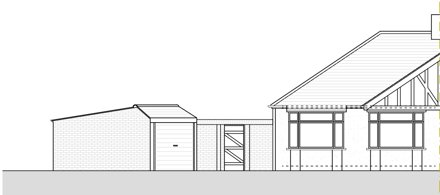
○ Front Elevation 1:100