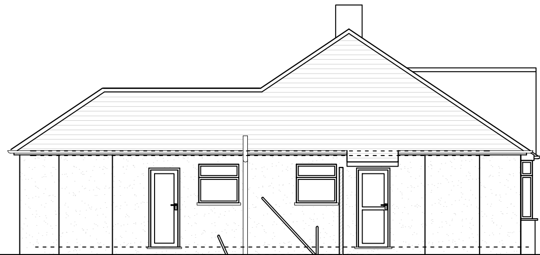
○ Side Elevation 1:100