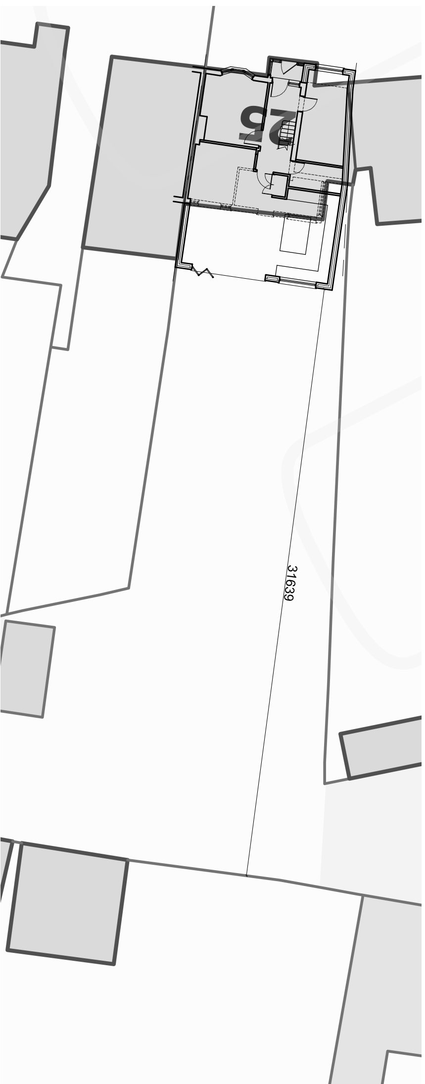
PROPOSED BLOCK PLAN - SCALE 1:200

The Contractor is to check all dimensions on site and report any discrepancies to the Contract Administrator. This drawing is to be read in conjunction with all other standard documentation. Dimensions are not to be scaled from this drawing.