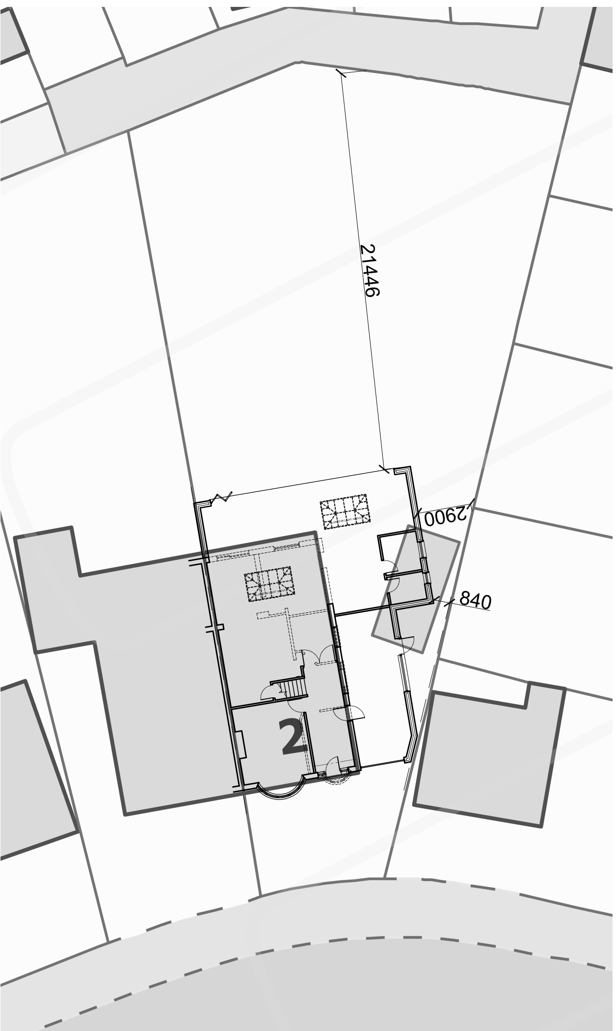
PROPOSED BLOCK PLAN - SCALE 1:200

The Contractor is to check all dimensions on site and report any discrepancies to the Contract Administrator. This drawing is to be read in conjunction with all other standard documentation. Dimensions are not to be scaled from the drawing.