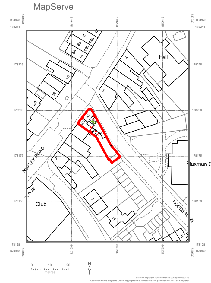
Existing Site Location Plan - Scale 1:1250

Proposed Flat Development at 17B Nuxley Road, Belvedere, Kent DA17 5JE