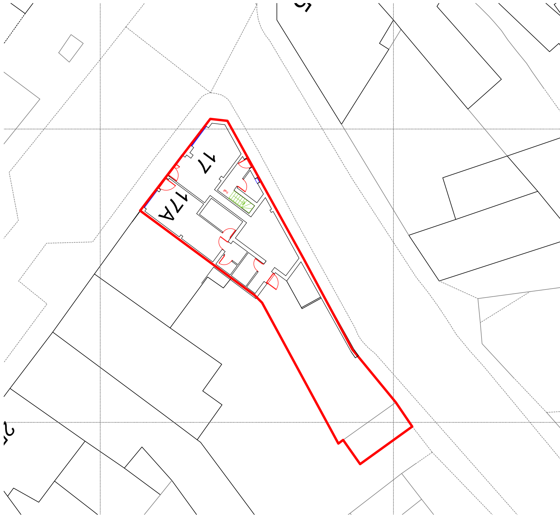
Existing Block Plan - Scale 1:200

DO NOT SCALE These drawings and designs are the copyright of SEVENCROFT LTD.