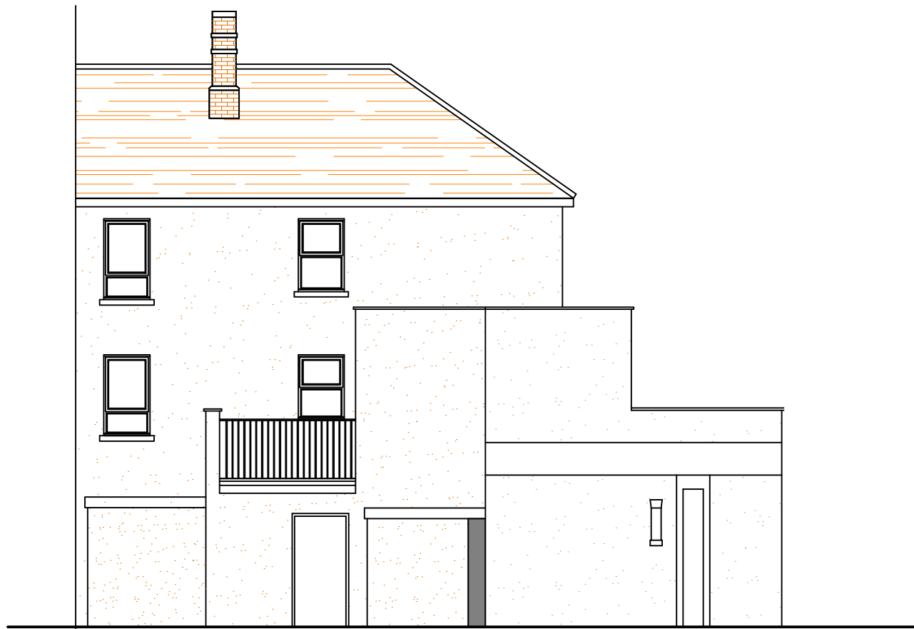
As Existing Rear Elevation facing Courtyard

DO NOT SCALE These drawings and designs are the copyright of SEVENCROFT LTD.