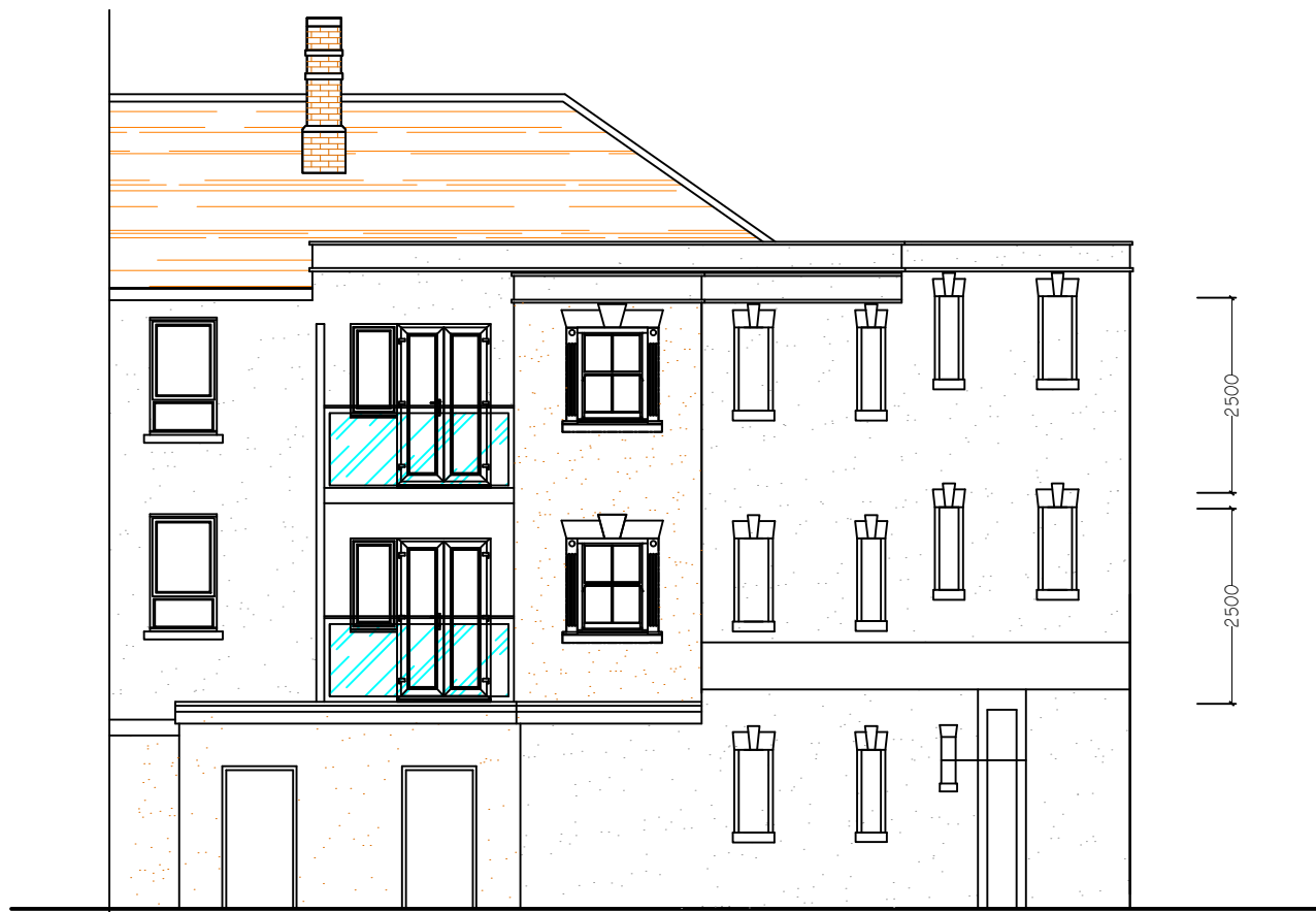
As Proposed Rear Elevation facing Courtyard

DO NOT SCALE These drawings and designs are the copyright of SEVENCROFT LTD.