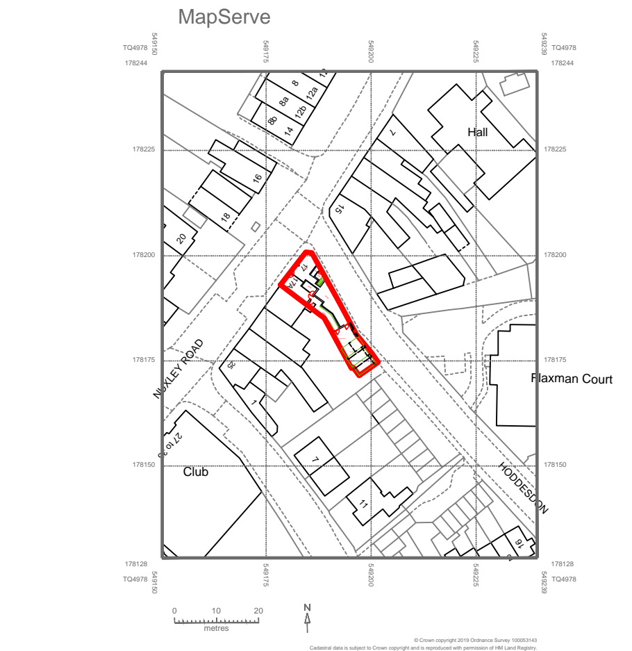
Proposed Site Location Plan - Scale 1:1250

Proposed Flat Development at 17B Nuxley Road, Belvedere, Kent DA17 5JE