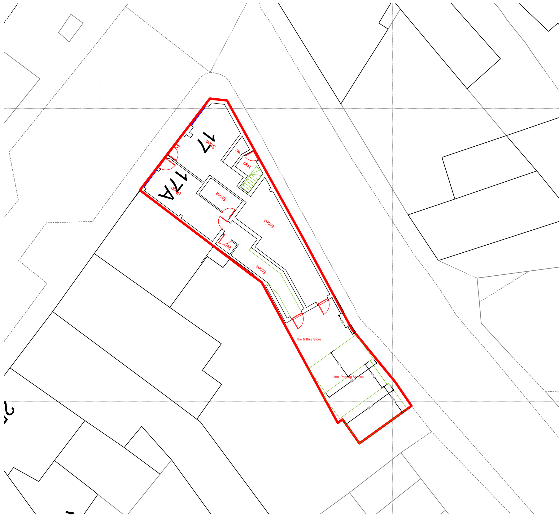
Proposed Block Plan - Scale 1:200

DO NOT SCALE These drawings and designs are the copyright of SEVENCROFT LTD.