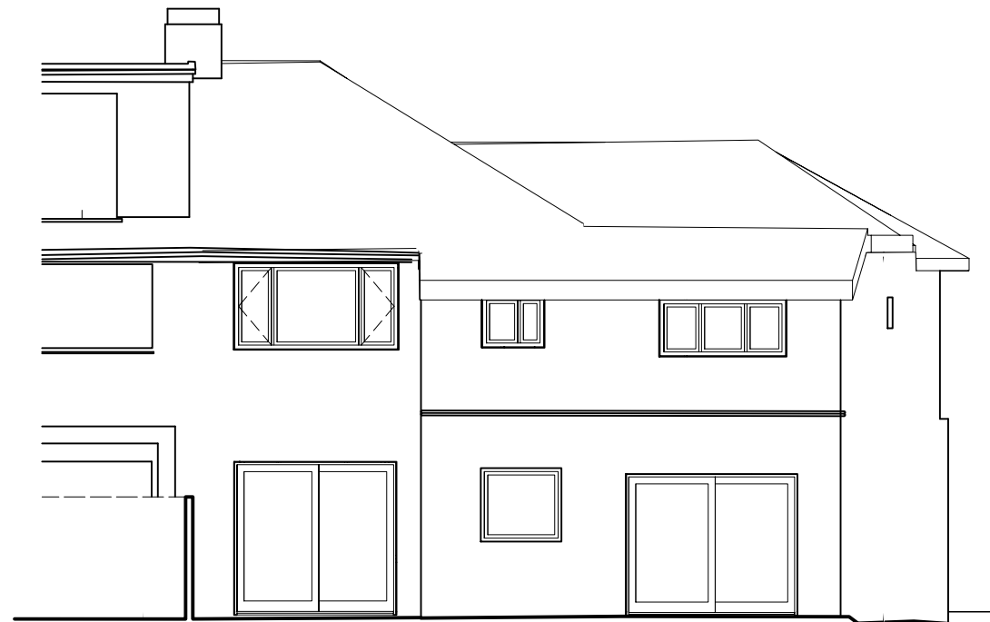
2 Existing Rear Elevation Scale: 1:100