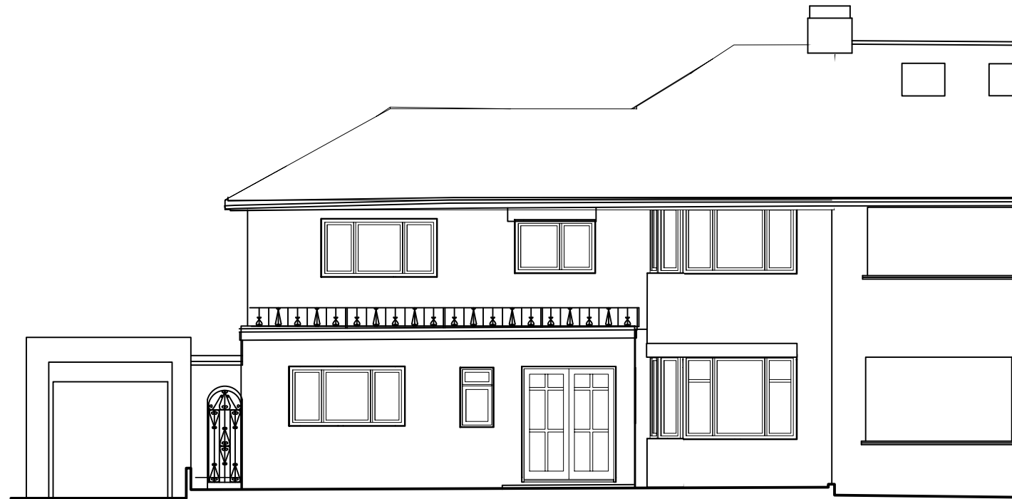
1 Existing Front Elevation Scale: 1:100