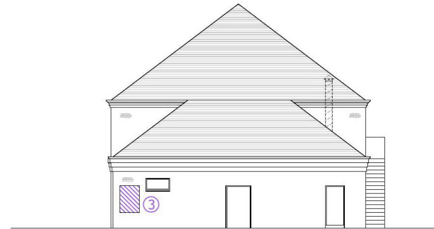
03 REAR (NORTH) ELEVATION TO CAR PARK SCALE 1:200@A3