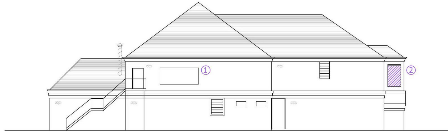
02 REAR (EAST) ELEVATION SCALE 1:200@A3