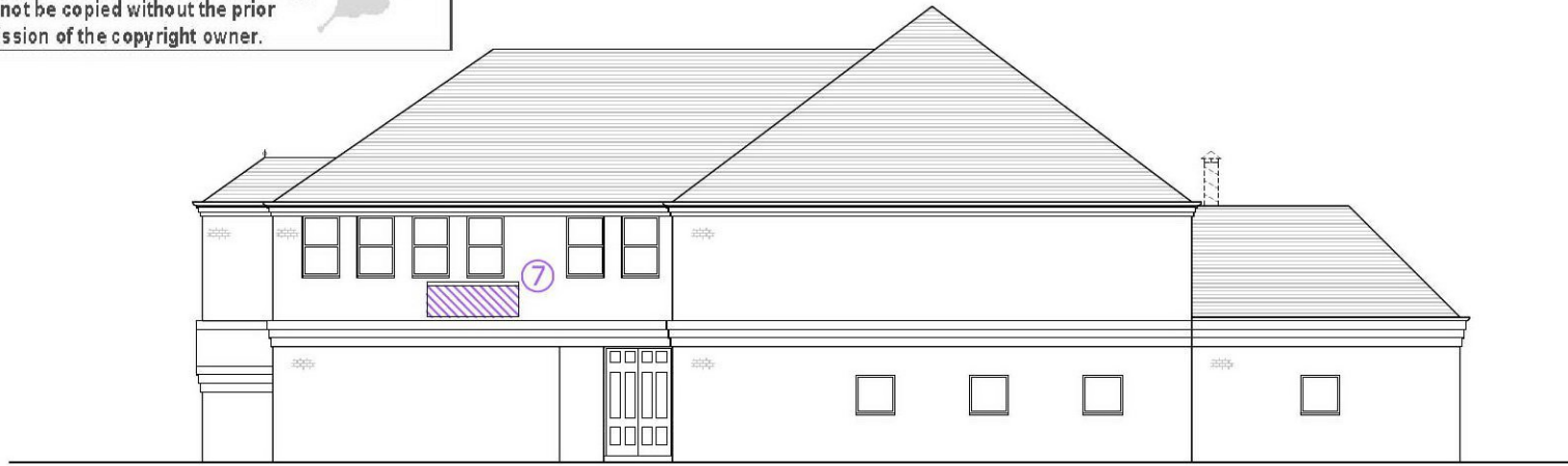
01 FRONT (WEST) ELEVATION TO IMRIE PLACE SCALE 1:200@A3

This copy has been made by or with the authority of Midlothian Council pursuant to Section 47 of the Designs and Patents Act 1988. Unless that Act provides a relevant exception to copyright, the copy must not be copied without the prior permission of the copyright owner.