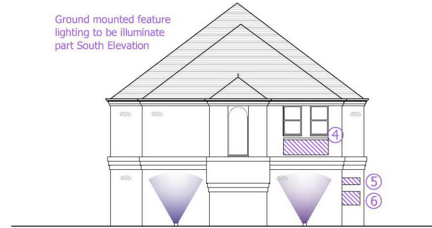
04 FRONT (SOUTH) ELEVATION TO KIRK HILL ROAD SCALE 1:200@A3