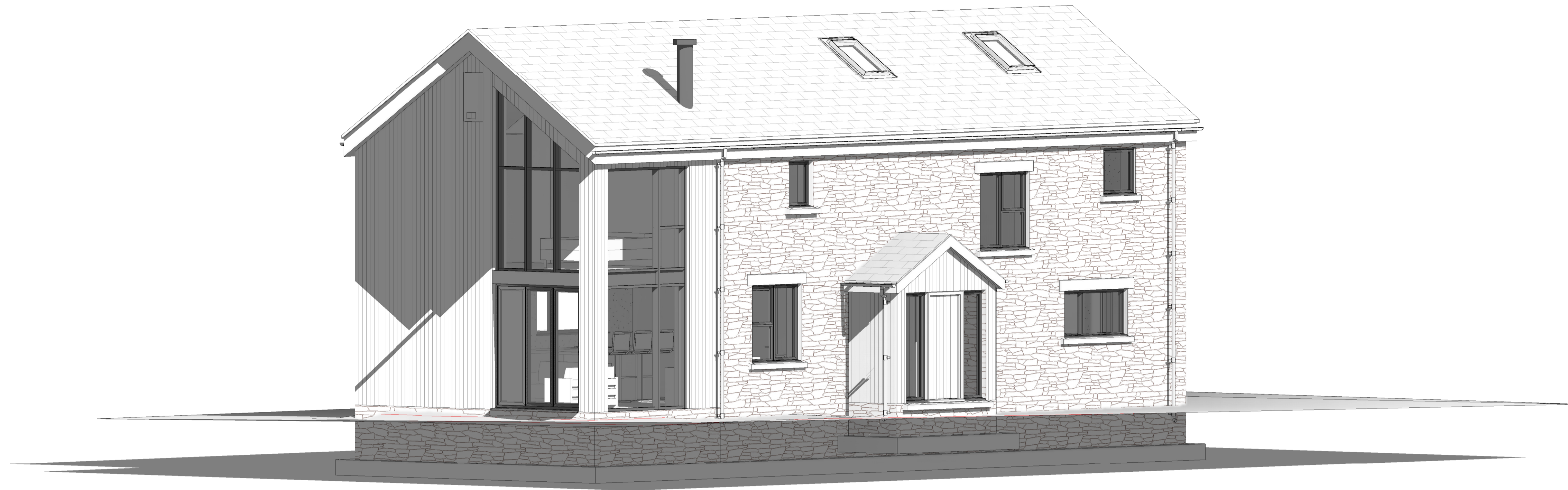
3D VIEW 01 1.NTS