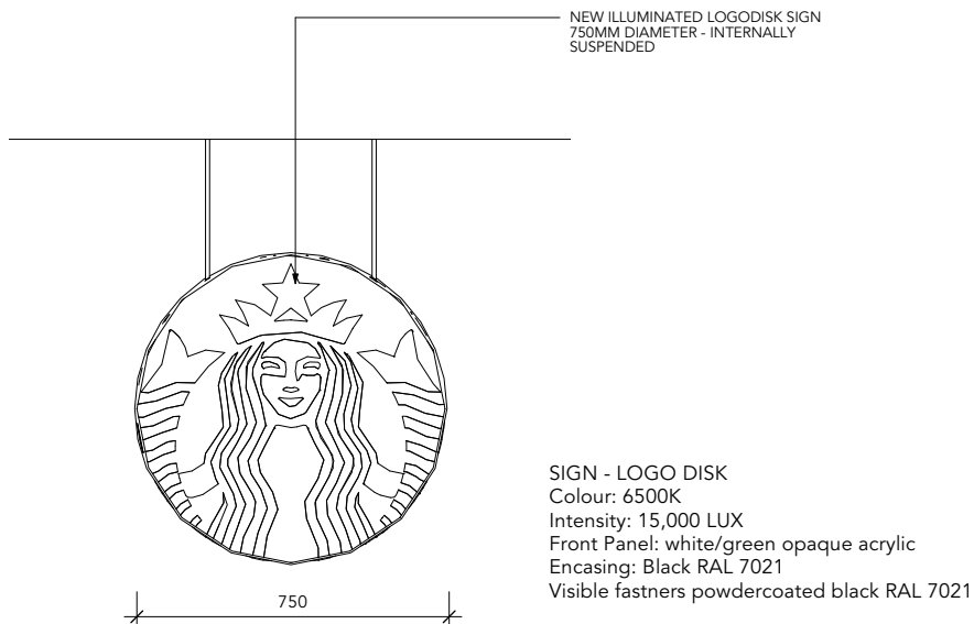
1 SIGN - LOGO DISK - 750MM Scale: 1:20