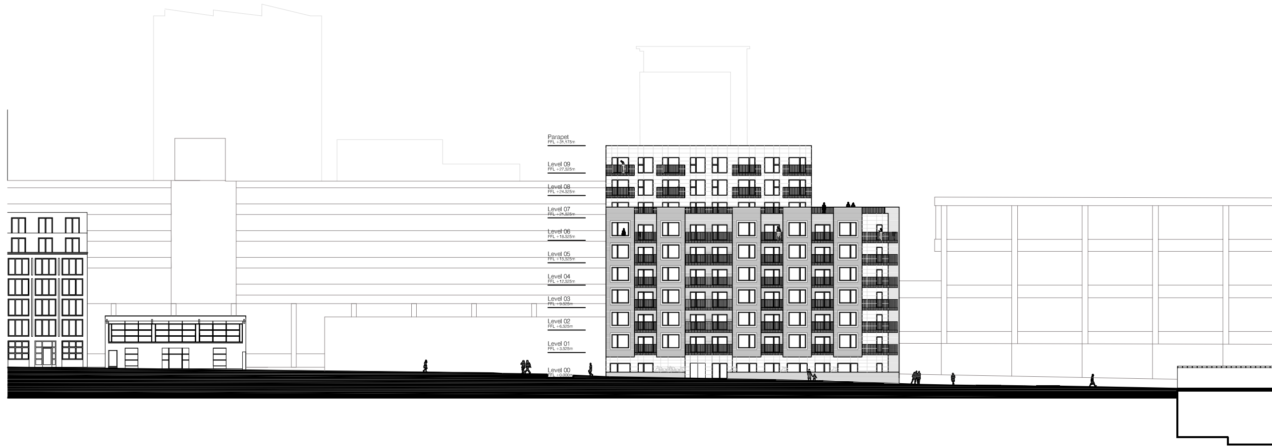
MINERVA STREET ELEVATION