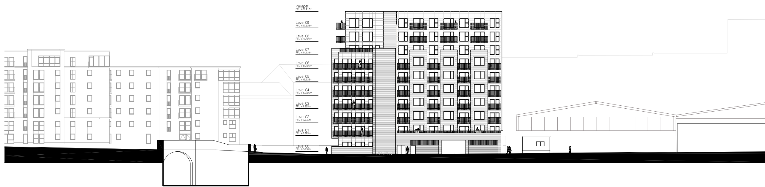
WEST GREENHILL PLACE ELEVATION