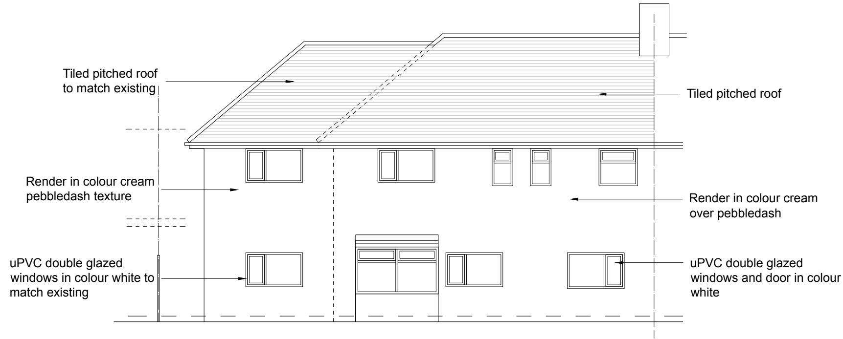
Rear (South West) Elevation as proposed Side extension