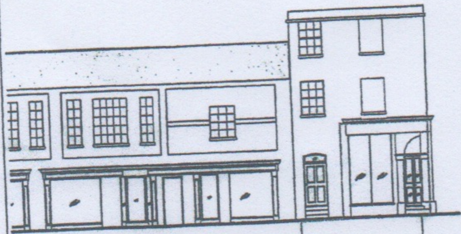
Tavistock Street Elevation