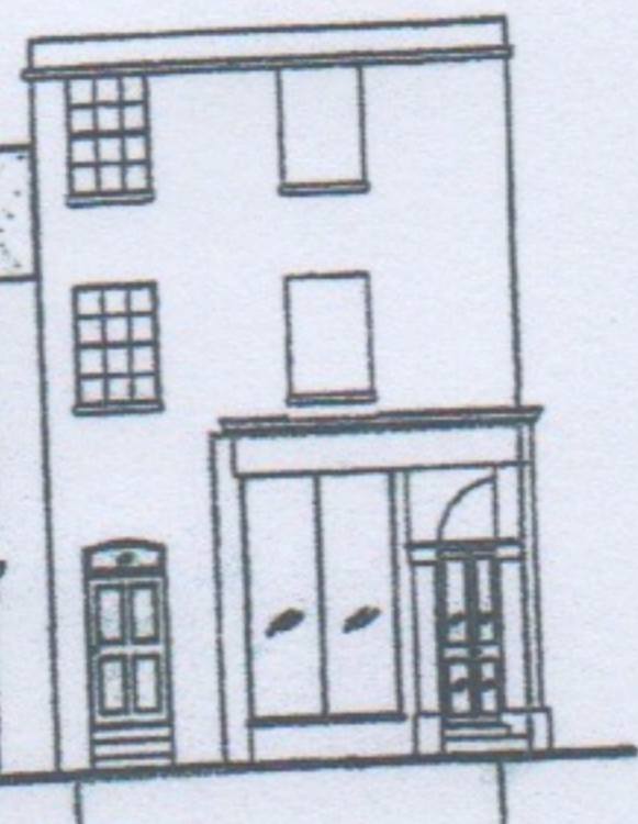
Clarendon Avenue Elevation