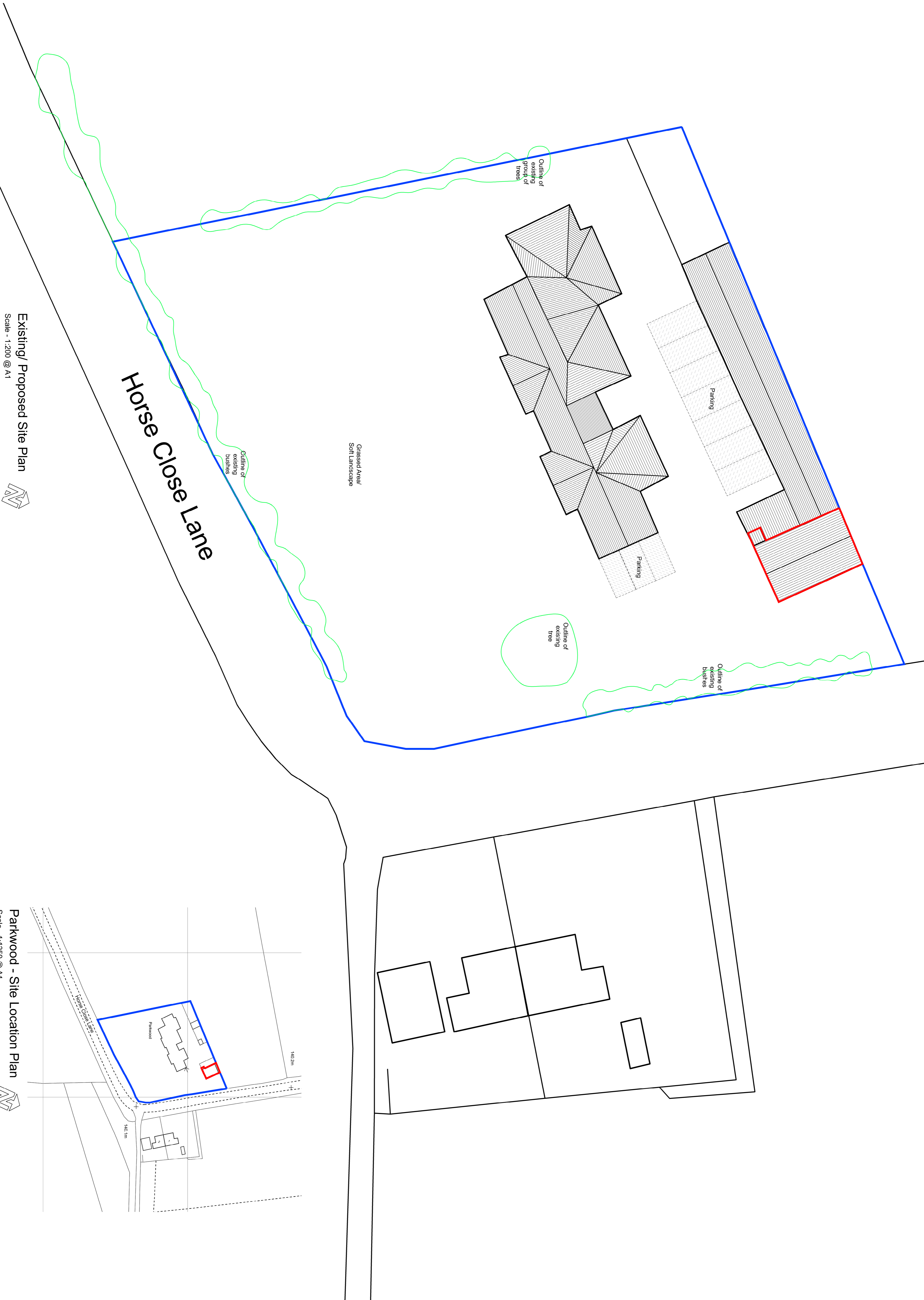
Existing/ Proposed Site Plan Scale - 1:200 @ A1

Key: ■ Denotes site boundary ■ Denotes area of proposal