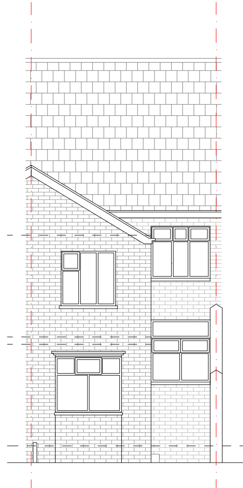
GA Existing Rear Elevation Scale 1:100 @ A3