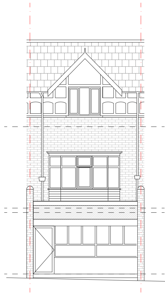
GA Existing Front Elevation Scale 1:100 @ A3