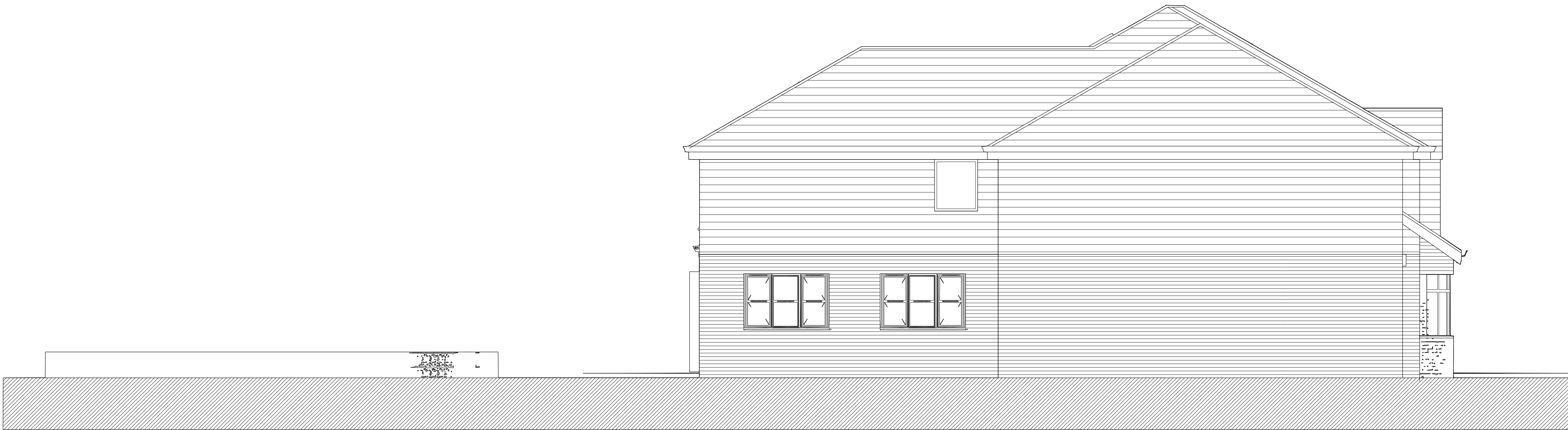
2 Proposed Side (Fairlawes) 1 : 100