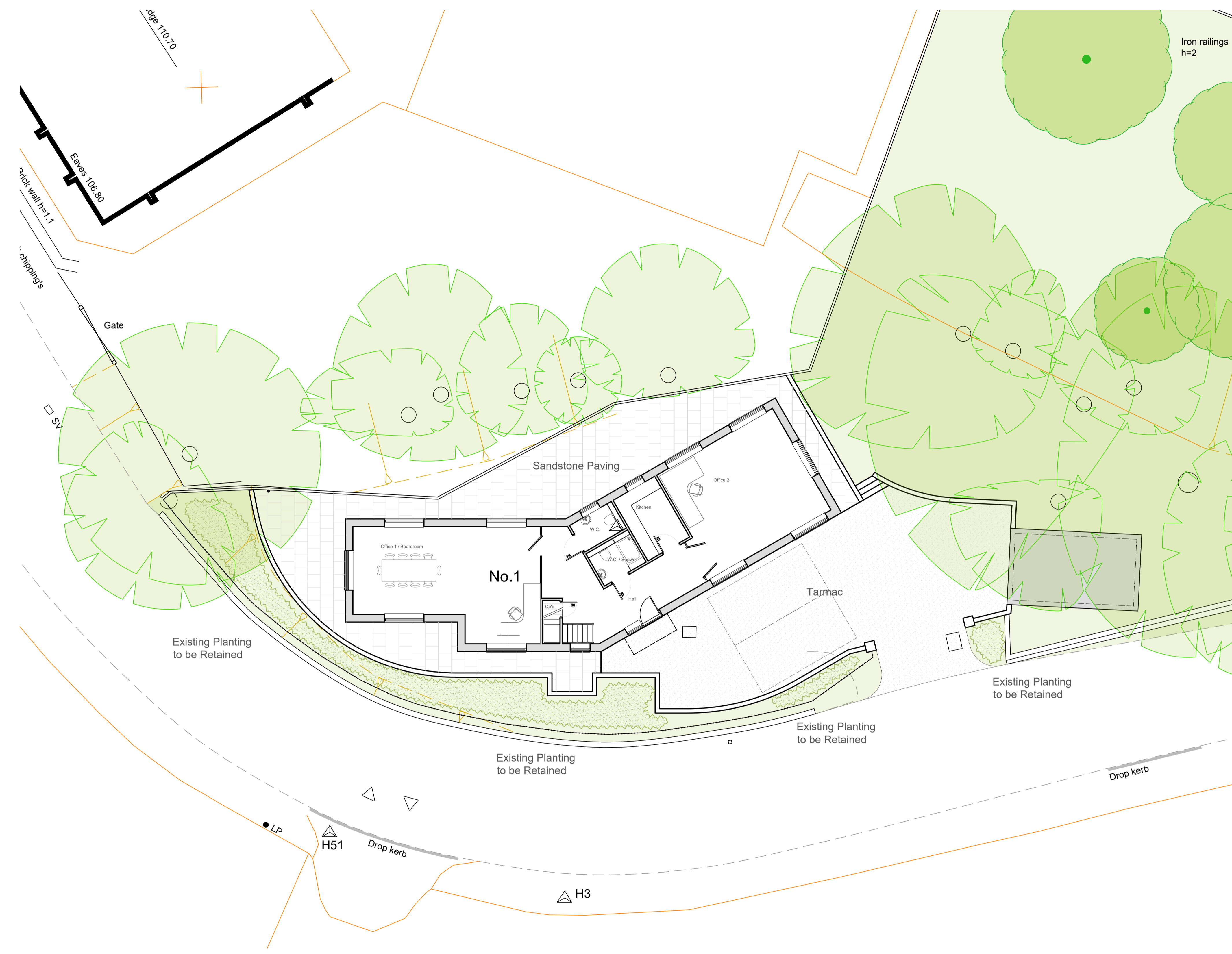
Proposed Site Plan - 1:100