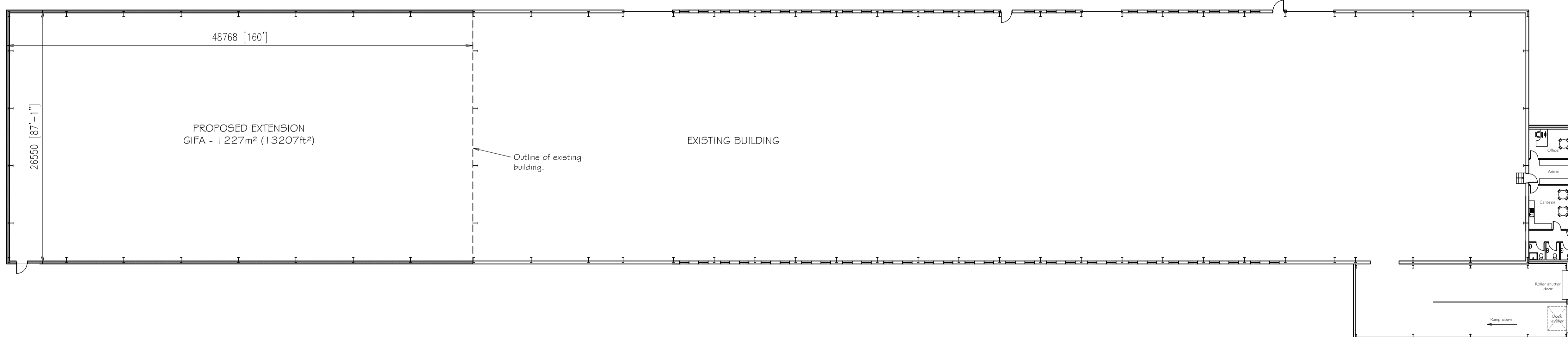
PROPOSED FLOOR PLAN 1:250